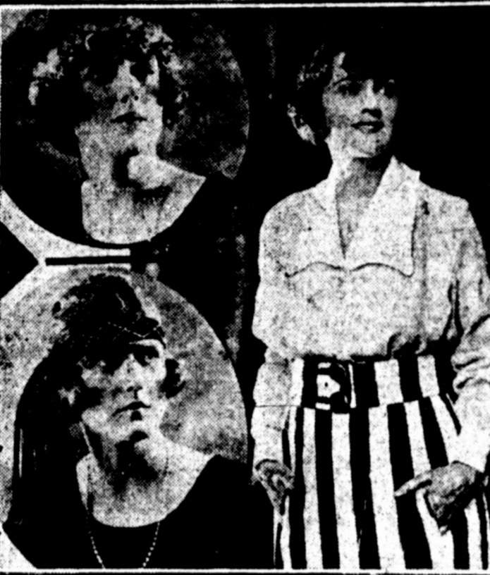
Three snappy French fashions, best of many now created by Parisian designers, are shown to America.

Three snappy French fashions, best of many now created by Parisian designers, are shown to America. All are stunning, and parvise of dazzling smartness, which is now demanded by the fashionable folk abroad.