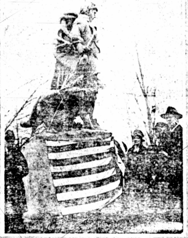
The memory of Robert Burns, best beloved of Scottish poets, has been immortalized by the bronze statue recently presented to the city of Boston by the Burns Memorial Association. The great bronze of Burns was unveiled by Governor Calvin Coolidge, of Massachusetts, while five hundred Scots of greater Boston and thousands of others witnessed the simple ceremony. The statue, which is nine feet high, and stands in the Back Bay Park, was erected at a cost of $23,000 after ten years' effort on the part of the association.