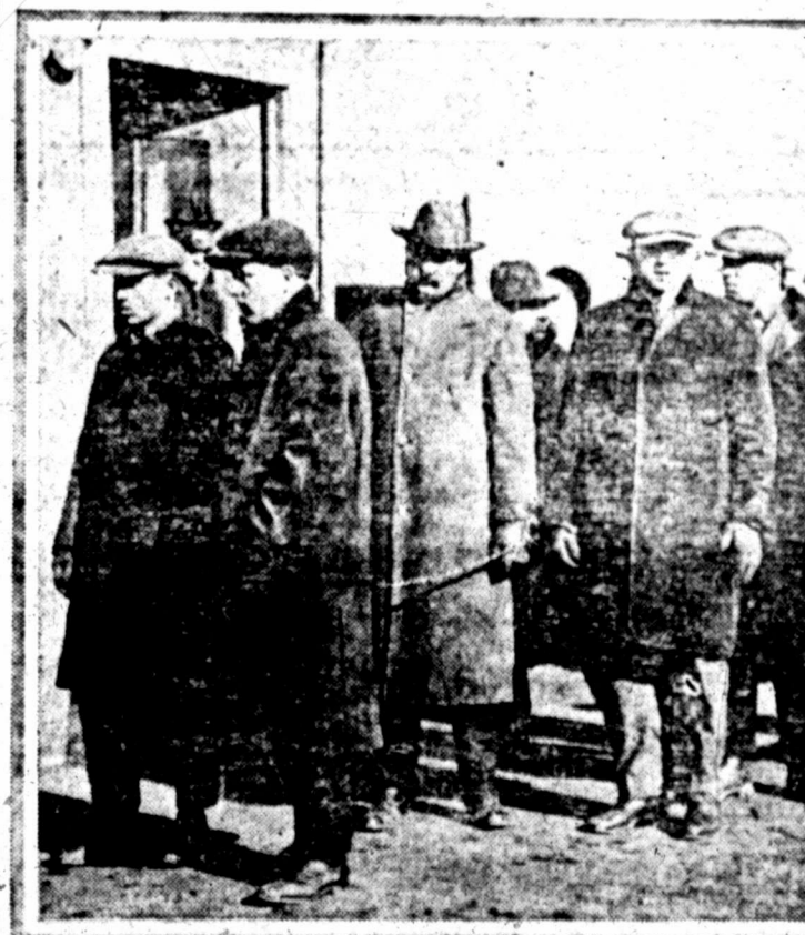
The nation-wide round-up of radicals which has been going on for several days continues unabated, and it is evident that the Government plans a thorough clean-up of the radical element. This photograph, taken at Boston, shows a group of alleged "reds" awaiting transportation to the island, the emigration station in the Port of Boston. All the men were shackled and chained in small groups.