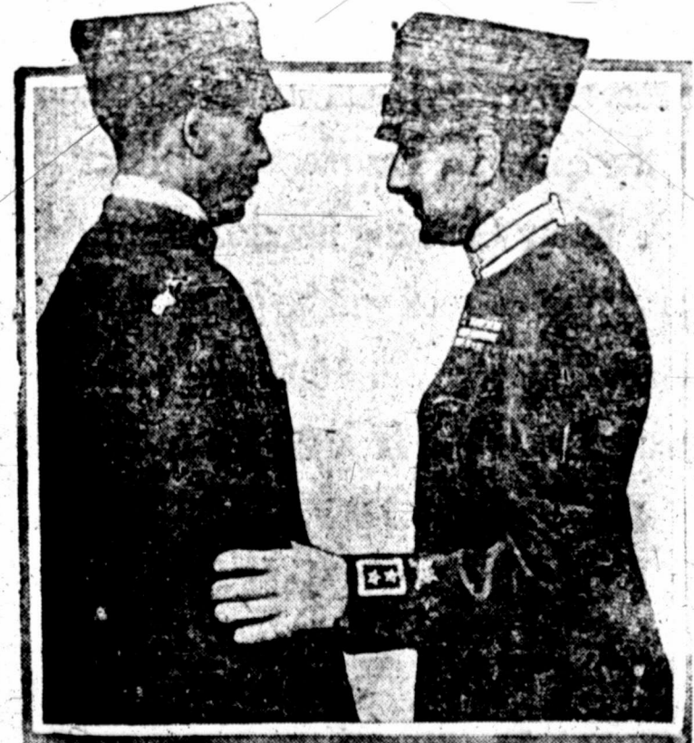
An exclusive photograph of Captain Gabriele D'Annunzio, Italian patriot who created a world sensation by his coup in Fiume, made during a recent grand review of his forces shortly before he turned over the city to Italian troops. Captain D'Annunzio, shown on the right, is wearing the uniform of a private soldier, although he wears his decoration ribbons.