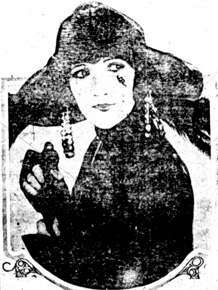
Here is absolutely the latest in vamping outfits. Here is the vamp supreme, and armed with weapons of attraction guaranteed to bring "home the bacon." Pretty face, ruby lips, hypnotizing eyes, a tiny serpent with shining green eyes, worn on the left cheek, black velvet costume and all. This charming "vamp" is none other than Miss Constance Talmadge, the winsome movie star. Miss Talmadge also has a first aid to the vamp kit in the top of the cane she carries. It is equipped with a complete boudoir set, mirror, powder, lip stick, rouge, etc.