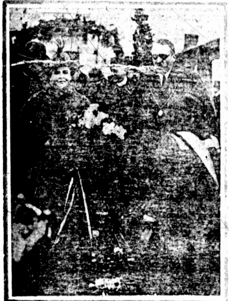
Her Majesty Queen Wilhelmina of Holland arriving at Brekens, Holland, during her tour of the provinces of Limburg, Zealand and Zealand-Flanders. Young ladies of Brekens are strewing flowers in the path of the popular Queen, who received a great reception throughout the provinces. The Queen's tour, it is thought, did much to strengthen the loyalty of her subjects and weld closer the patriotism and interests of her people. This is the latest photograph of the Queen received in this country.