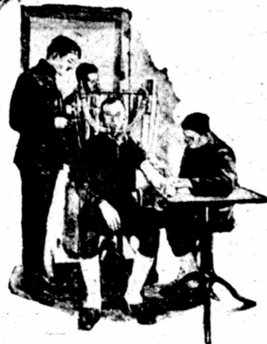
Of one hundred fliers only sixty-one can work at an altitude of more than 20,000 feet. The rebreathing machine determines precisely the altitude at which the flier will fail.

How much can you see without turning your head? To determine this, the aviation candidate is asked to fix his uncovered eye on the white spot in the center of the perimeter, as the machine is called, and, without removing his gaze from this spot, to indicate when he sees another spot move into the field of vision.