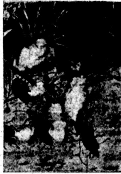
These Beetles Are Carrying on a Gas Attack.

Concerning the Carabao. In the United States the carabao, or water buffalo, is an object seldom found outside zoos and circus exhibits, but in the Philippine Islands it is nearly as common as horses are here. In fact it is the draft animal of the natives. But it differs from horses, and even oxen, which it slightly resembles, in that it is very fond of the water and is most unhappy if not allowed to spend some time each day in a pool or stream.—Popular Mechanics.