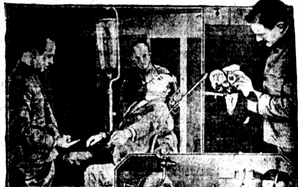
The aviator must have good ear-rotation sense. When he is shrouded in cloud it tells him whether or not he is flying on an even keel. This sense depends on a fluid in the canals of the inner ear. One test is to douche the ear with cold water and then have the subject attempt to point (with eyes closed) at where he last saw the examiner's finger.

When one eye is shaded from the light and the other is covered and uncovered rapidly, the pupil of the eye that is shaded will dilate and then contract about as the uncovered eye does—that is, it will if the eyes have normal connection between the fibers of the two optic nerves.