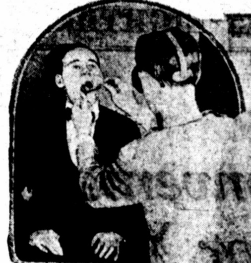
"Probably eighty per cent of the sick calls on the other side are made up of sore throats," says the report of the Air Service Medical. That's why this aviation candidate is being examined so thoroughly for adenoids and diseased tonsils.