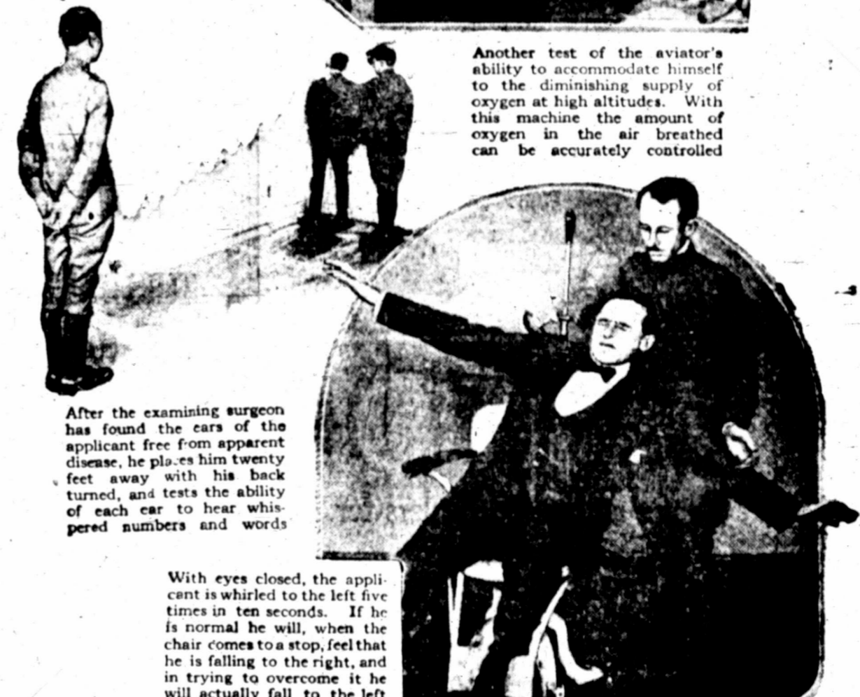
After the examining surgeon has found the ears of the applicant free from apparent disease, he places him twenty feet away with his back turned, and tests the ability of each ear to hear whispered numbers and words.