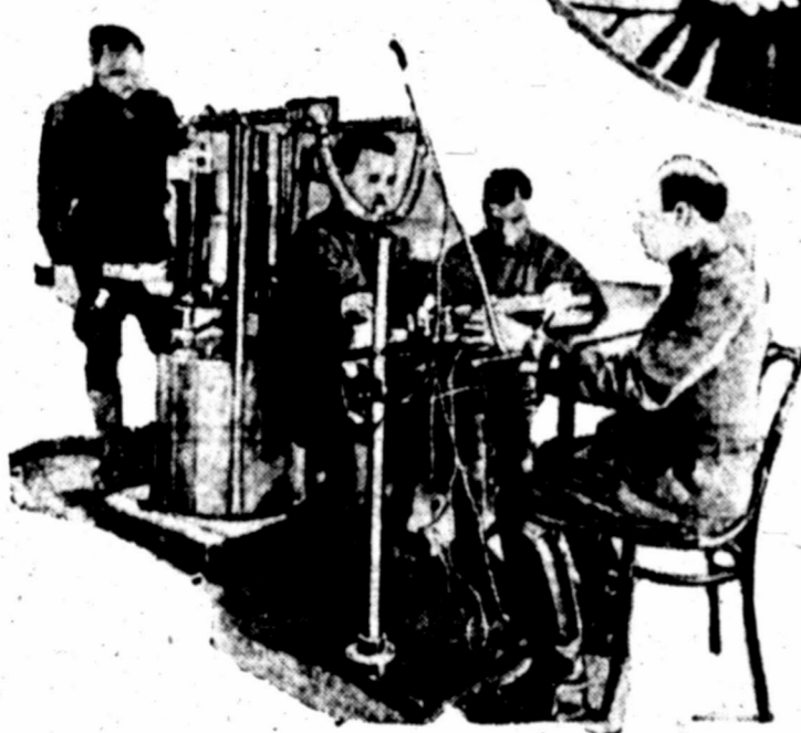
Testing the psychological effects on the aviator of lack of oxygen, to determine how efficient he will be when he is flying at high altitudes.

How much can you see without turning your head? To determine this, the aviation candidate is asked to fix his uncovered eye on the white spot in the center of the perimeter, as the machine is called, and, without removing his gaze from this spot, to indicate when he sees another spot move into the field of vision.