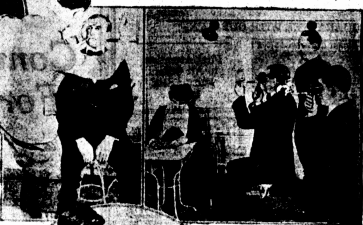
The aviator must be a good judge of distance. If he isn't he will not be able to tell the arrangement of an enemy formation or land safely at high speed. Here he is being tested for stereoscopic vision. If he has it he is probably a good judge of distance.