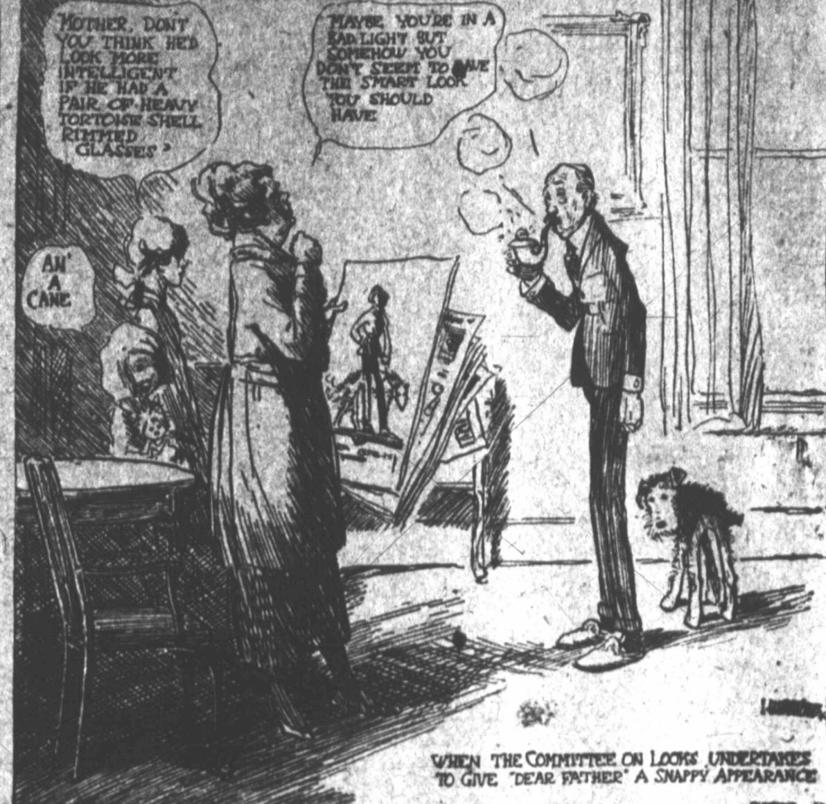
WHEN THE COMMITTEE ON LOOKS UNDERTAKES TO GIVE 'DEAR FATHER' A SNAPPY APPEARANCE