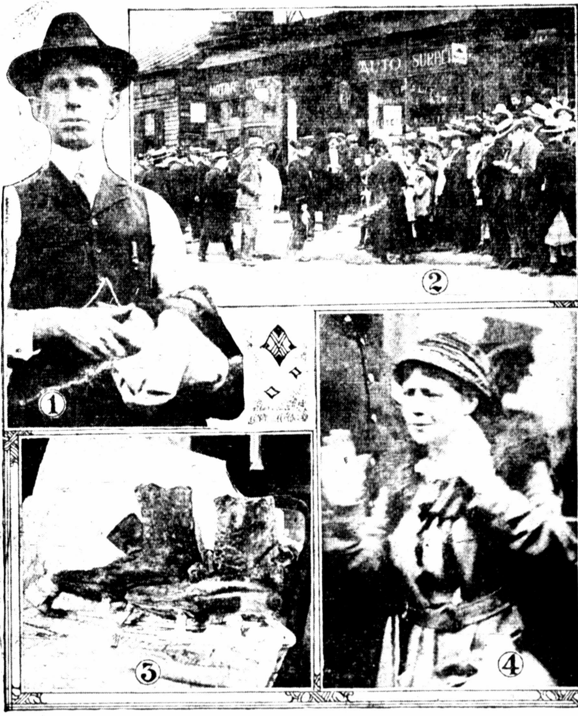
While the case of Ruth Cruger is being investigated by the New York police, the case of the murder of Ruth Cruger is being investigated by the New York police. The case of Ruth Cruger is being investigated by the New York police. The case of Ruth Cruger is being investigated by the New York police.