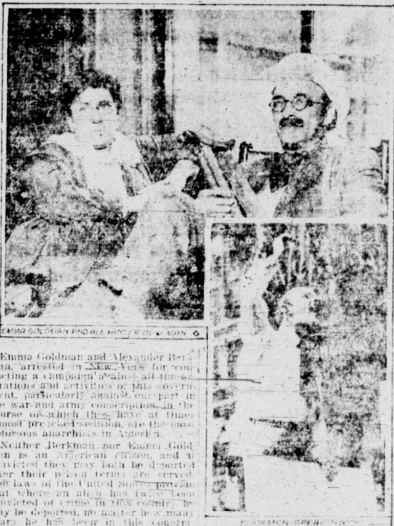
EMMA GOLDMAN

Emma Goldman and Alexander Berkman, arrested in New York for conducting a campaign against all the patriotic and artistic of this country, particularly against our part in the war and army conscription in the course of which they have at times abused the press and other means of communication, are being held in the notorious anarchists in America.