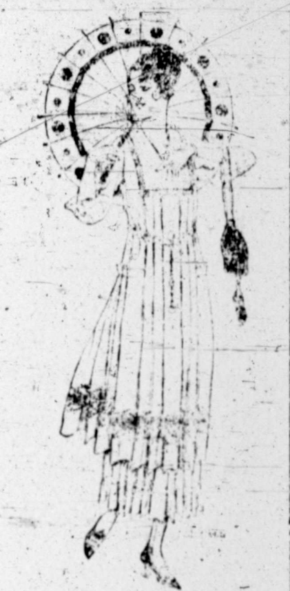
A Cool, Summer Dress Trimmed With Flirt Lace.

Apart from the use of lace and net in making entire dresses, in small proportions we find them used either together or independently in many costumes. Large bibs of net or lace with high collars are worn with tailored suits, the jabot spreading itself over the front of the coat and lighting up the dark suits.