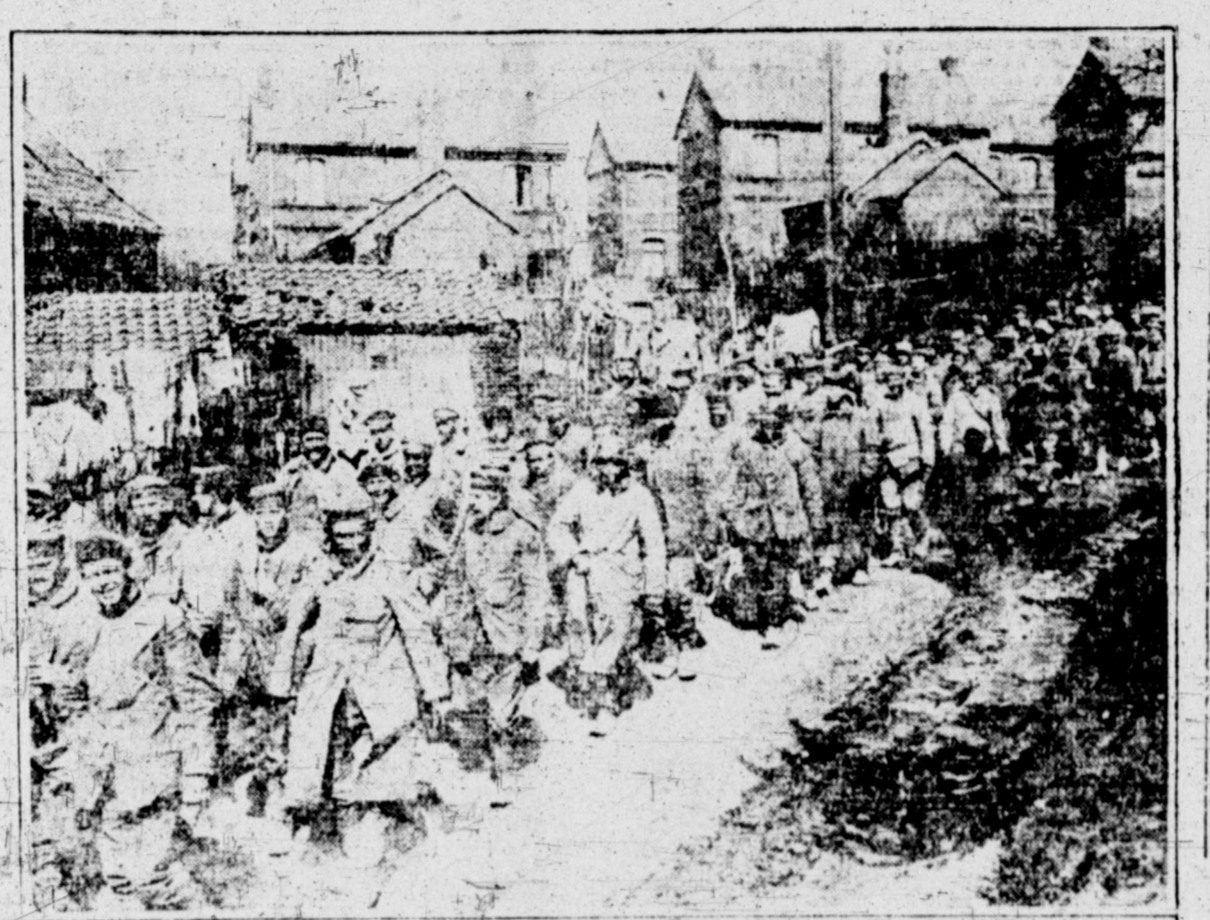
GERMAN PRISONERS CAPTURED BY CANADIANS PASSING THROUGH FRENCH VILLAGES.