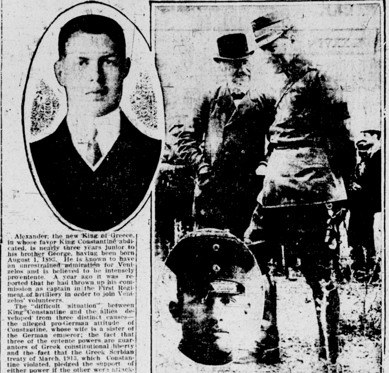
UPPER, LEFT, ALEXANDER, RIGHT, VENIZELIS AND CONSTANTINE LOWER, PRINCE GEORGE