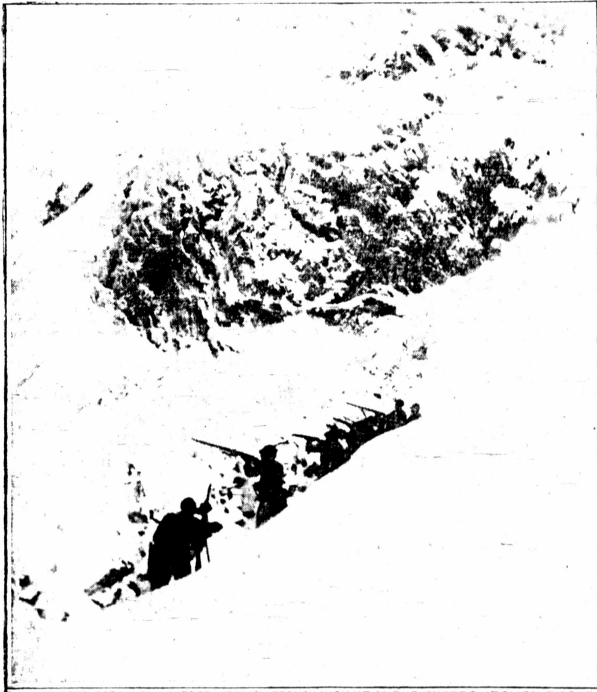
HIGHEST BATTLEGROUND IN EUROPE—ITALIAN TRENCH HIGH UP ON THE AUSTRO-ITALIAN FRONT

Even Austrian writers on the war now admit that the Italian offensive against the formidable strong Austrian positions in the mountains succeeded in its objective and that the efforts of the Italian arms deserve the highest admiration.