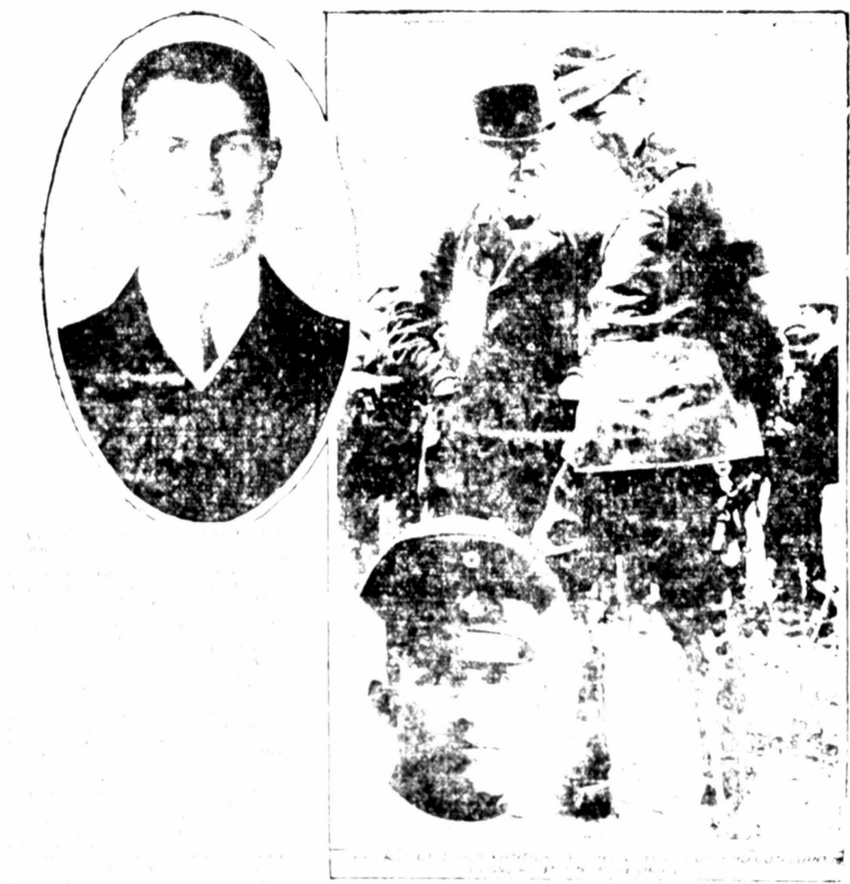
Alexander, new king of Greece, is Venizelist and anti-German.