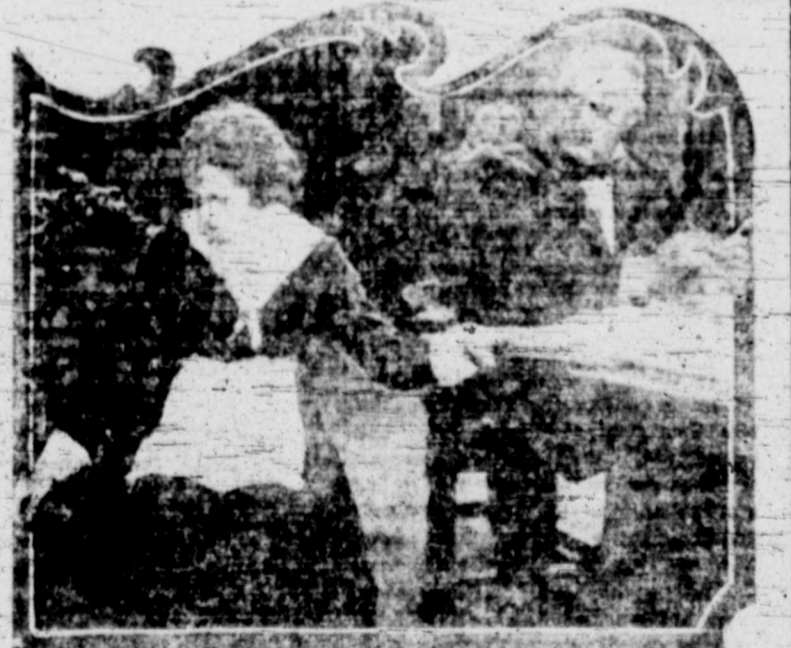
ANITA STEWART in "THE GIRL PHILIPPA"