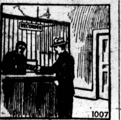
'THE RECORDING OF A DEED' $100.00 will buy a corner lot on Tenth Street, 50x150 feet.

Cravens, Walker & Co. Phone 694. K. & K. Building