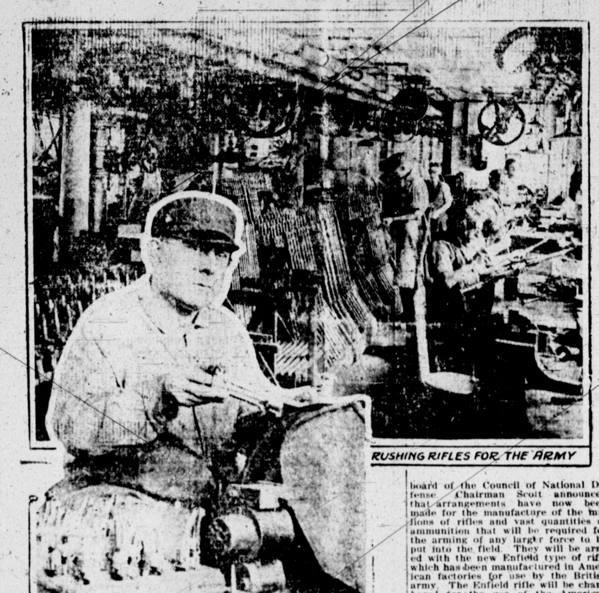
RUSHING RIFLES FOR THE ARMY