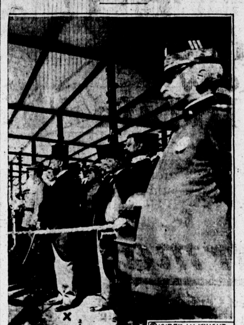
INAUGURATION OF PRESIDENT MENOCA (X) OF CUBA