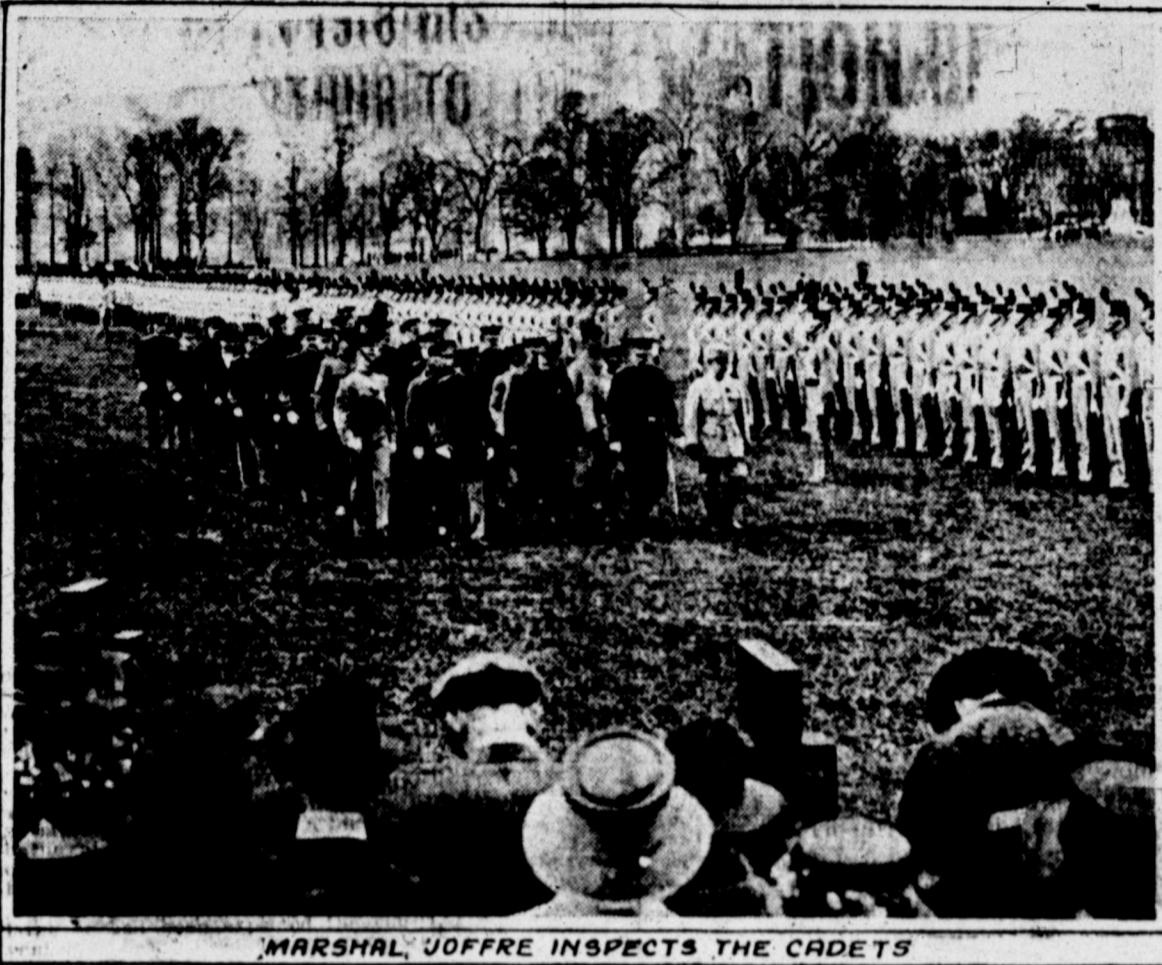
MARSHAL JOFFRE INSPECTS THE CADETS

Photo by American Press Association. West Point was taken by Marshal Joffre and Marshal Joffre was captured by West Point. In the course of a few hours he saw America's wonder (it corps of cadets at their very best).