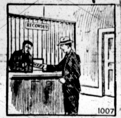
'THE RECORDING OF A DEED' $1050.00 will buy a corner lot on Tenth Street, 50x150 feet.

FOR SALE—Collie pup, 6 months old. Apply 806 Denver, Phone 2191. 3-11c