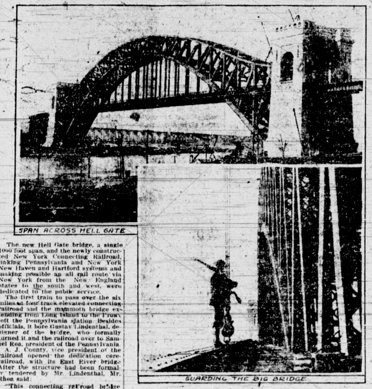
SPAN ACROSS HELL GATE GUARDING THE BIG BRIDGE