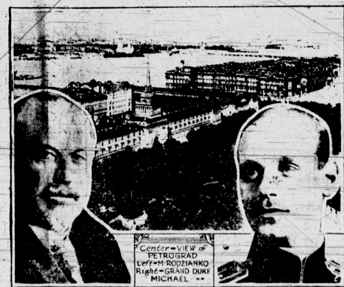
Center—VIEW OF PETROGRAD Left—M. RODZIANKO Right—GRAND DUKE MICHAEL

GRAND DUKE MICHAEL AND M. RODZIANKO ARE LEADING FIGURES IN RUSSIA'S CRISIS