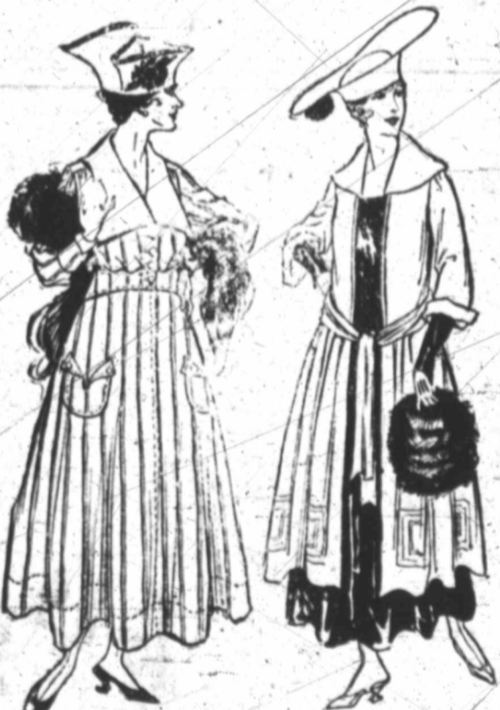
Smart Walking Costume McCall's Waist Pattern No. 7429 and SKIRT 7429