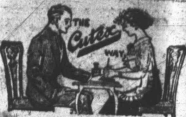
Once you use Cutax Manicuring Preparations you will always demand them.

A shower of stars will descend upon Wichita Falls Wednesday, November 1st at the Wichita Theatre bringing with them a regular "whale" of a show called "Watch Your Step."