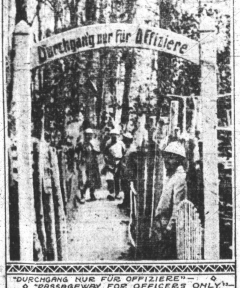
Among the positions captured by the French in a recent drive on the Somme front was one in which they found the sign reproduced in the picture. It reads, "Durchgang nur für Offiziere." Translated this reads, "Passageway for officers only." Behind the sign was a road that was well built, considering its proximity to the battle line. Gates barred the entrance to the thoroughfare, and presumably, it was guarded by sentries before the attack of the French.