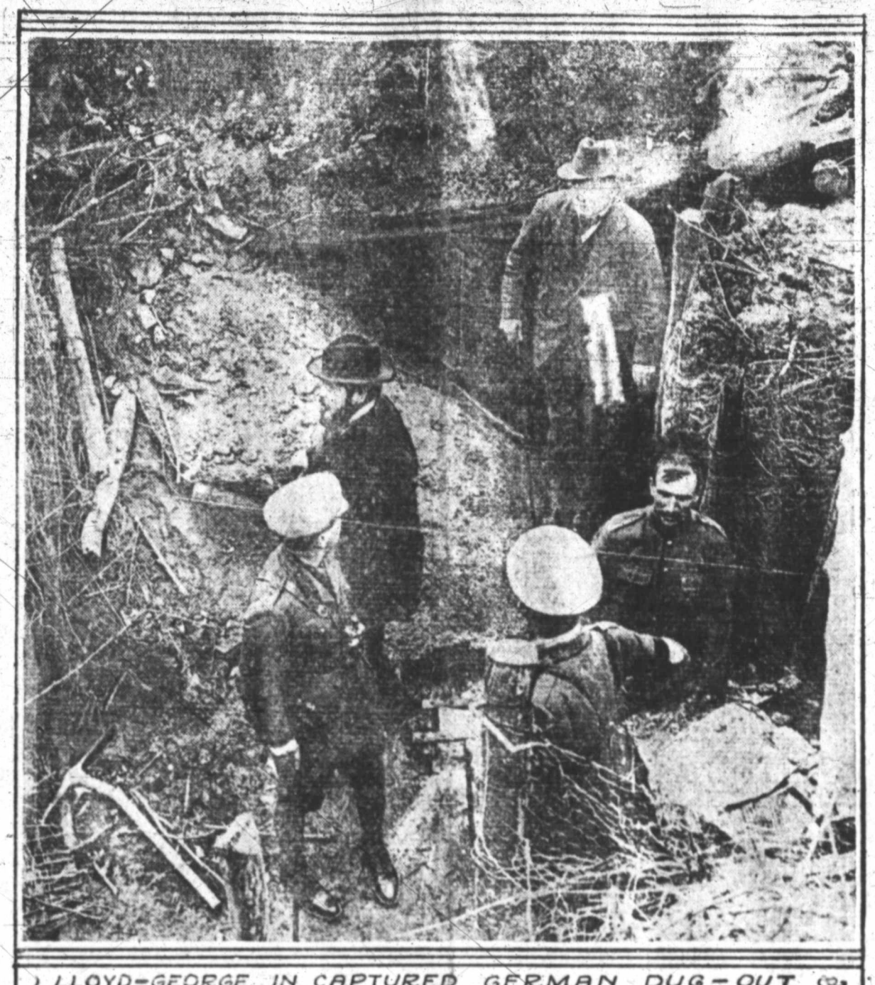
LLOYD-GEORGE IN CAPTURED GERMAN DUG-OUT

In his recent visit to the fighting front in France David Lloyd-George, British minister of war, was accompanied by M. Thomas, French minister of munitions, and Baron Reading, lord chief justice of England.