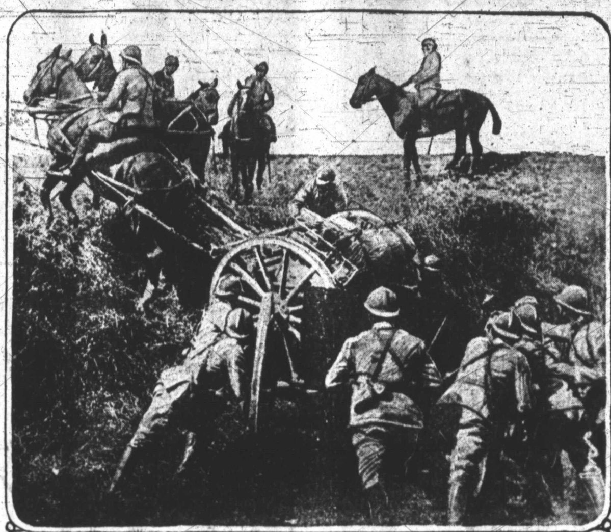
FRENCH "75" ADVANCING ON THE SOMME

Recent war reports renew the tributes paid since the beginning of the war to the famous French six-caliber gun, the "soixante-quinze" (sixty-five millimeter caliber) gun, acknowledged on all sides to be one of the best field guns in the world if not the best.