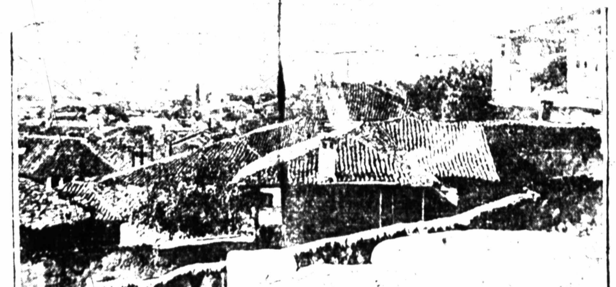
MONASTIR AND SERBIAN REFUGEES IN SALONIKI