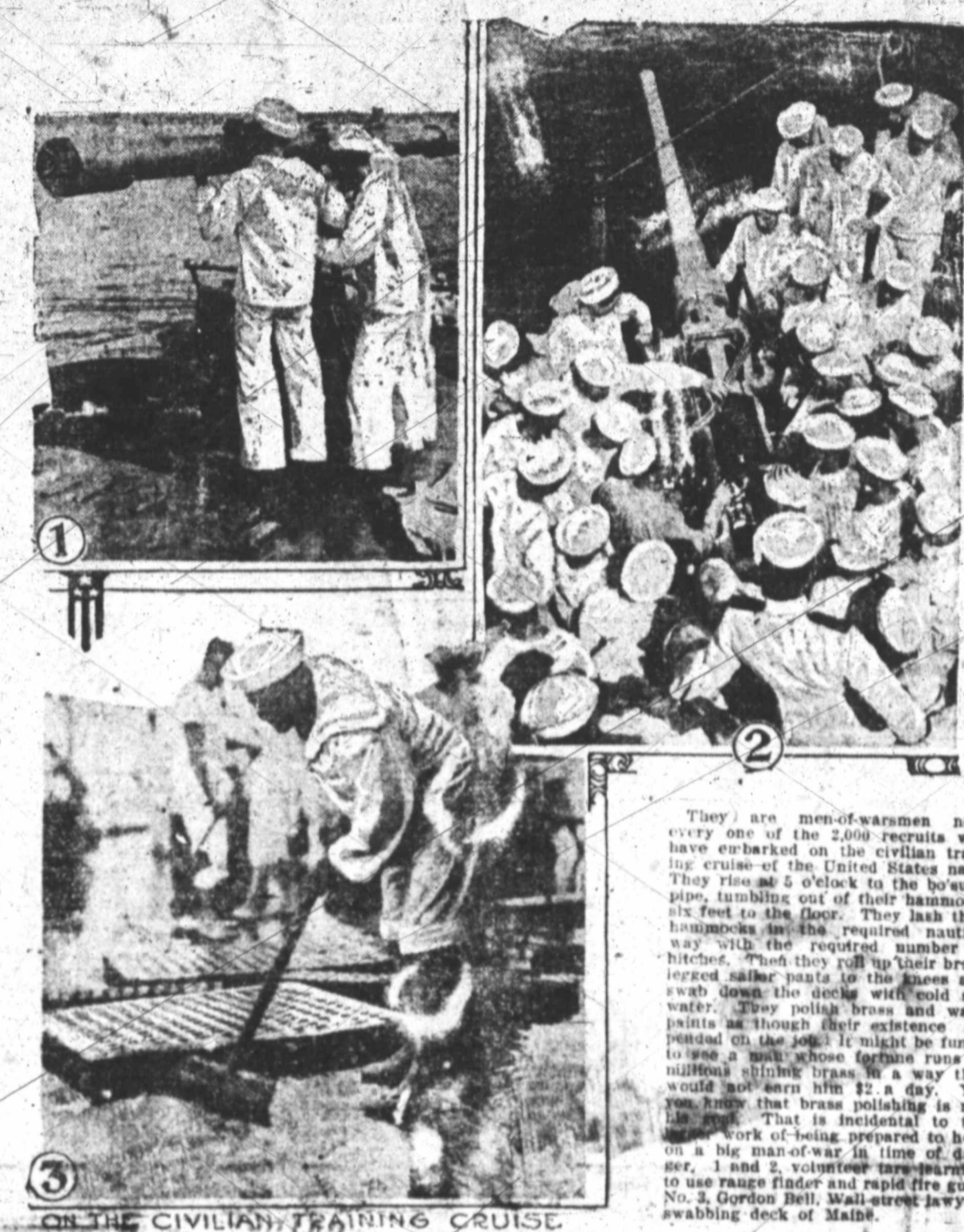
ON THE CIVILIAN TRAINING CRUISE.