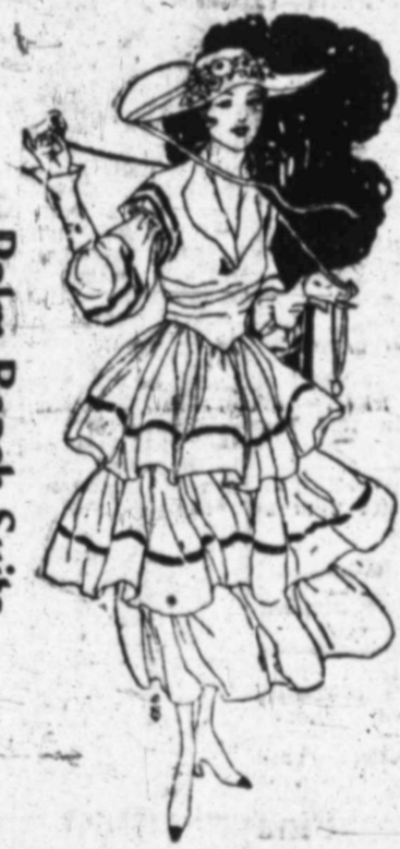
Ladies' Wool Suits at Half Price