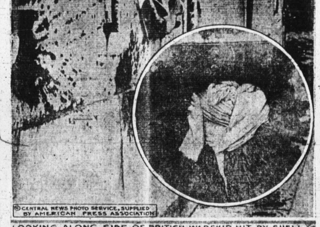
LOOKING ALONG SIDE OF BRITISH WARSHIP HIT BY SHELL HOLE STUFFED WITH BEDDING

These pictures, made from the first photographs received in America from England, illustrate damage done to a British warship in the great sea fight off Jutland on May 31. One of the pictures shows the battle scarred side of the vessel; the other shows how the shell hole, seen at left of the larger picture, was stoppered by bedding. The German and British admiral's accounts of the damage sustained by each side in the battle still differ, each government claiming a victory, or at least partial victory, in the fight.