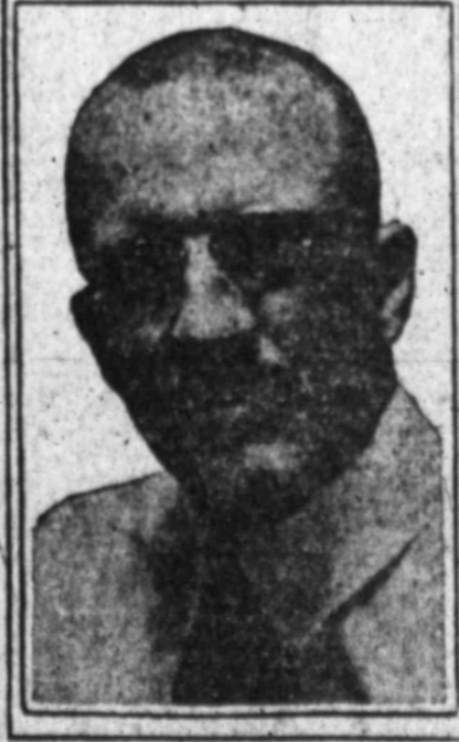
Newspaper Feature Service, 1919.

"It seems to me that the whole matter centres around repression. Repression not only of desires but of thought and understanding. In this we have the most striking instance of the survival of the Puritanical strain in the American mind. Hide, cover up, do not speak with your daughters of love, marriage, childbirth—and if you do speak of these things do so in hushed, ashamed tones. Do not properly prepare them for the world. Keep them ignorant of the greatest thing in the world—sex consciousness and love."