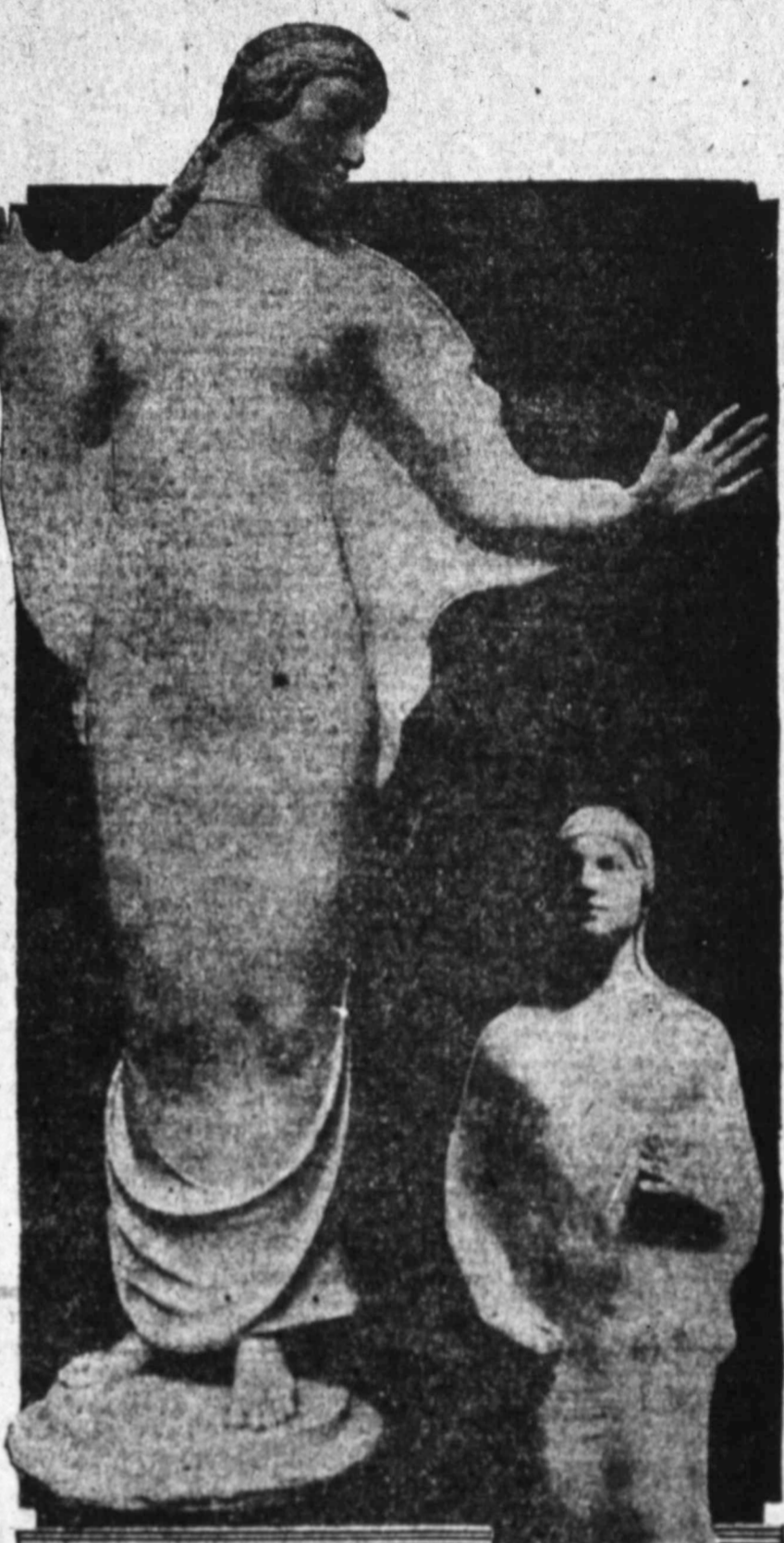
"The Offering of Love."