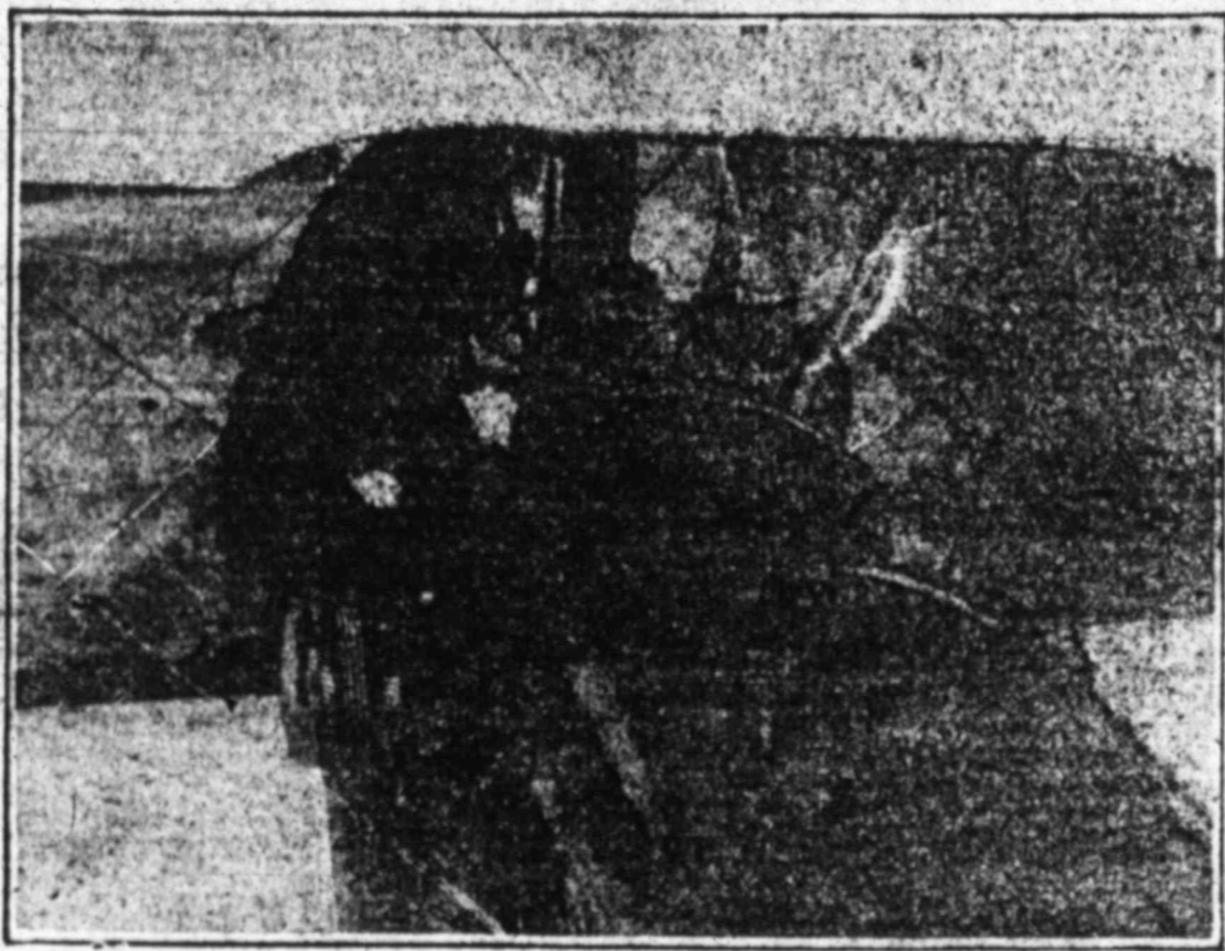
Entering a Modern Roadster Airplane Equipped for Two Passengers.

In most photographs taken of passengers in aeroplanes everyone appears to be smiling. For the pilot of course a flight is an old story and he looks busy or plainly bored. It is common, however, for the passenger to face the new experience with a smiling countenance. Even if one is frankly alarmed you nevertheless go forward with a smile. An observing pilot may see that the smiles are more or less forced at times, but it is rare for anyone to admit nervousness, even in the face of danger. By far the greater num-