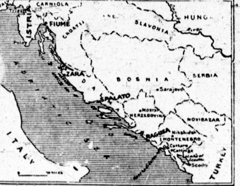
MAP OF DALMATIAN COAST MENACED BY D'ANNUNZIO.