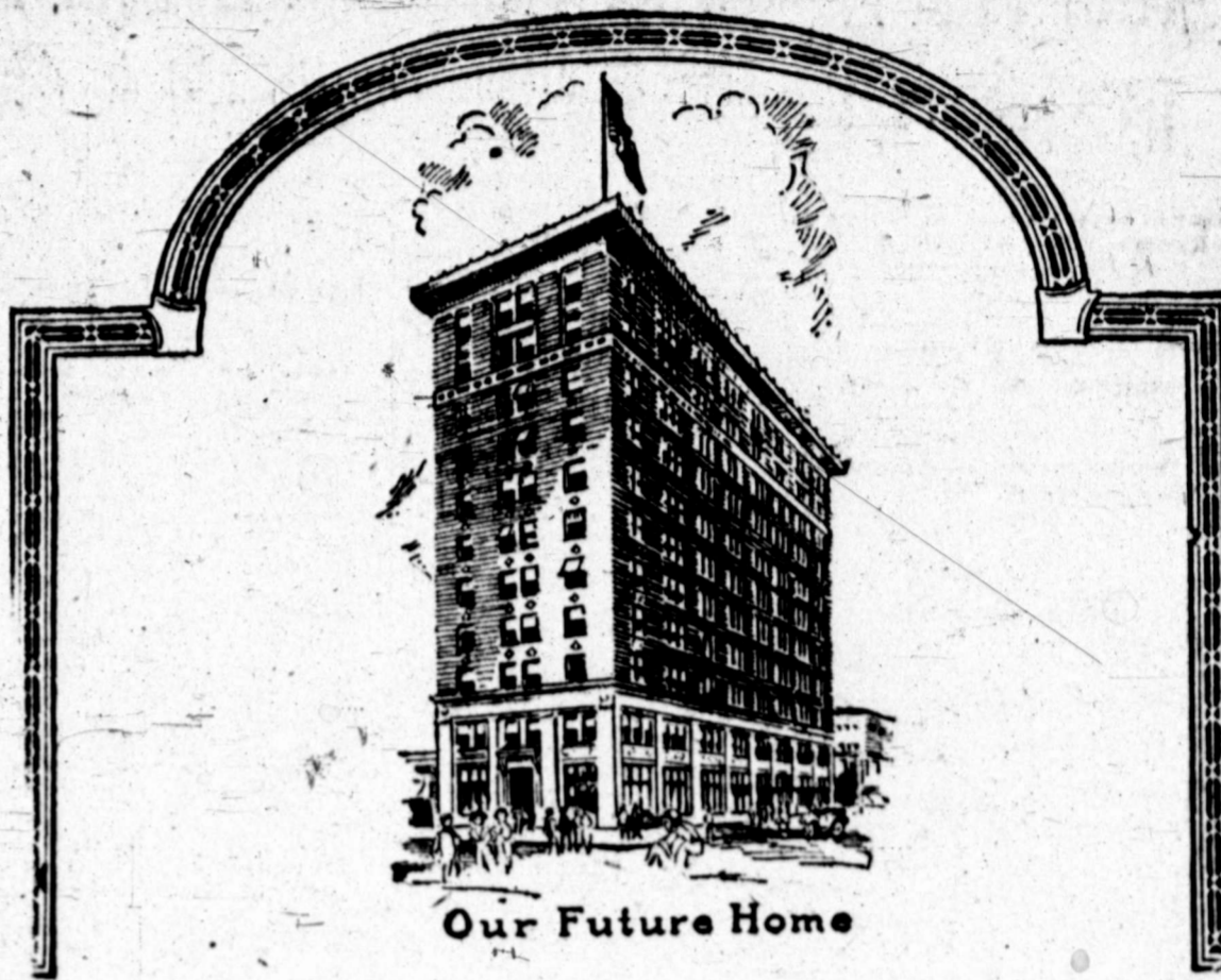
Our Future Home

DUNBAR MOLASSES & SYRUP CO. NEW YORK NEW ORLEANS, LA. MEMPHIS