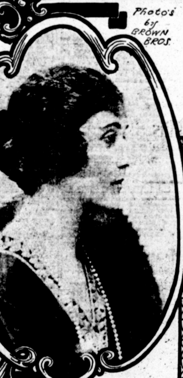
Mrs. Alexander R. M. Ramsay the former Princess Patricia.