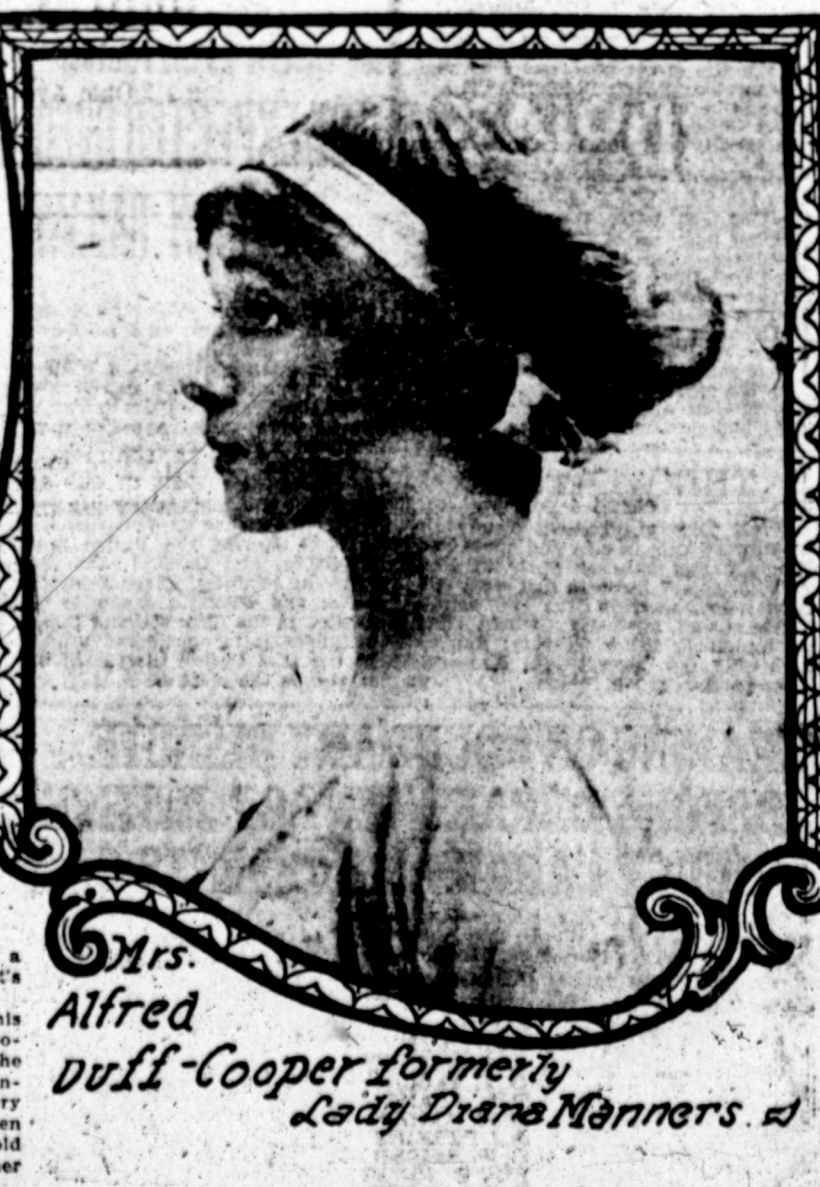
Mrs. Alfred Duff-Cooper formerly Lady Diana Manners.