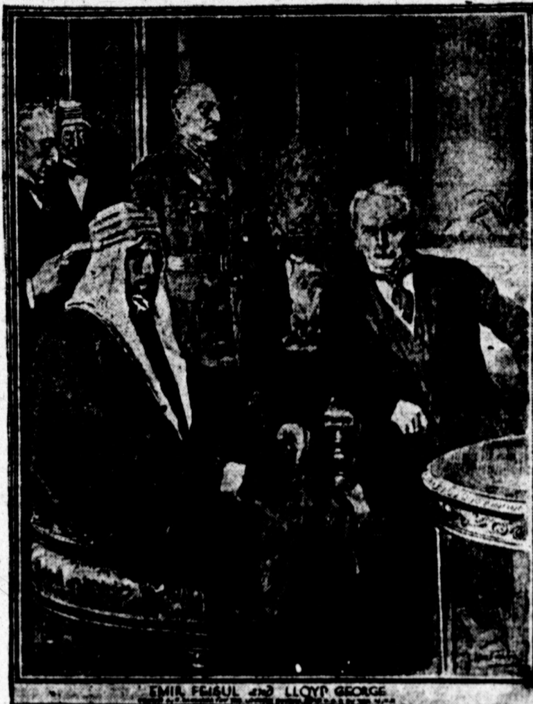
Given by R. Matas for the Sultan, London, and Corriant to the U. S. by the N. Y. N. Co. The Syrian situation as outlined in recent cable despatches has developed into one of serious proportions. Emir Faisal, heir of the King of Hedjaz, has been a picturesque figure in the post-war negotiations between representatives of Britain, France and the United States. He is shown herewith on a visit to England's Premier at Downing street and conversed with him at great length on the question of Syria. The conversation was carried on through the medium of a Foreign Office interpreter.