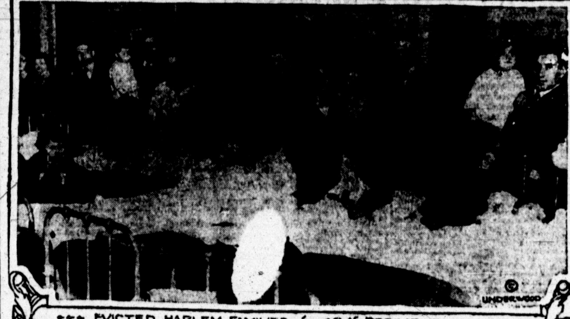
EVICTED HARLEM FAMILIES IN 12th REGIMENT ARMORY

Uncle Sam has been the "big daddy" in many cases of destruction to his past, and he still is living up to the established reputation. More than one hundred evicted families in Harlem, New York city, found themselves thrust into the street by heartless landlords and marshals with no other abelter over their heads than a murky sky. Mothers with babies only a few days old received no more sympathy from the property owners than aged men and women approaching the century mark.