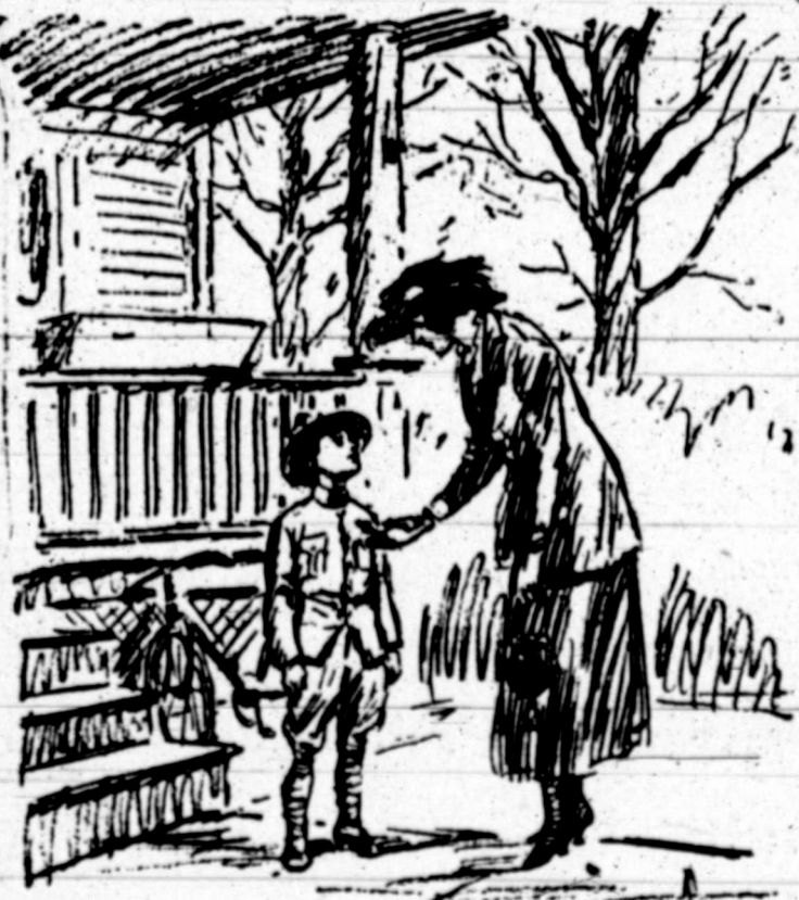
My Brother's. He Didn't Come Back

Changed in Transit. One of the methods of communicating from one officer to another in the trenches is to give the message to one of the privates and tell him to "pass the word along" the line until it reaches its destination, viz., the officer at the other end. The following story will show how a serious message can be distorted on its journey from mouth to mouth. Lieut. A., in charge of one end of the British line, bid the private in front to "pass the word along" to Lieut. B.: "We are going to advance. Can you send us reinforcements?" When Lieut. B. received the message it was like this "We are going to a dance. Can you send us three and fourpence?" Something New. Inebriated One (to local professor with reputation for great knowledge) — Some people think they know everything. After this had been repeated two or three times the professor replied that he had known people who thought they knew more than they did know, but that he had never met anyone who claimed to know everything. Inebriated One—Well, I can tell you something you don't know! My wife is your washerwoman, and I'm wearing one of your shirts. Only a Dream. I had a dream the other night; I dreamed that the umbrella I loaned away back in the fall To a careless sort of fellow, Had been returned by him at last, To save unpleasant scandal— Recovered neatly, and my name Carved quaintly in the handle.