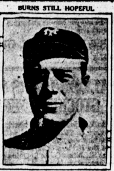
BURNS STILL HOPEFUL George Burns, the veteran left fielder of the Giants, is one player who has not lost hope that the Giants will still come through and win the pennant...