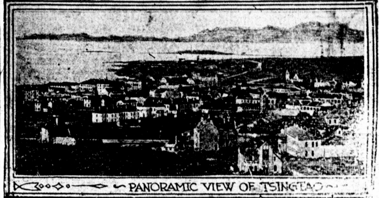
PANORAMIC VIEW OF TSINGTAO