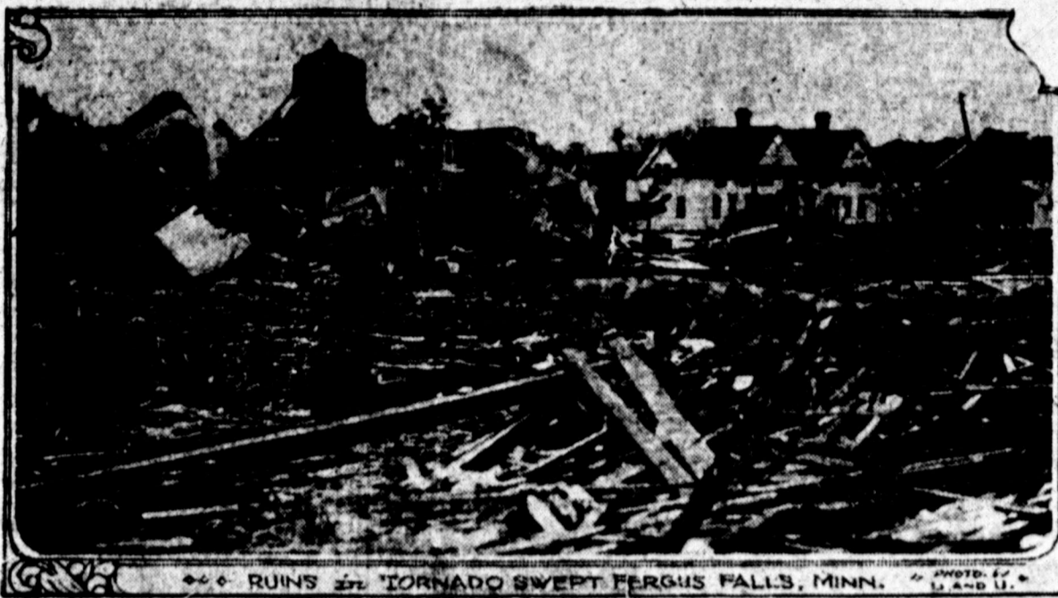
RUINS OF TORNADO SWEEP FERGUS FALLS, MINN.

tain from their boats, which could not be driven close to the dangerous shore.