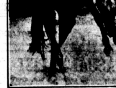
Wichita Falls, Texas

Remember the date, May 15, 16, 17, 1919.