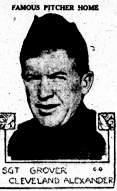
SGT GROVER CLEVELAND ALEXANDER

Good Rotary Rig For Sale CAN DELIVER NOW Telephone 721 or 1636 —Call— Suite 5, J-K Building.