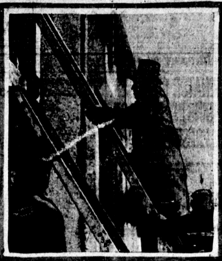
Commander-in-Chief of the American army climbs ladders to see the quarters of the 102d Infantry, Twenty-sixth division (Yankee division). The 102d was formerly the Second Missouri Infantry, with detachments of the First New Hampshire and the Eighth Massachusetts. The division was billeted in and around Mandras les Noyons, in the Marne sector.