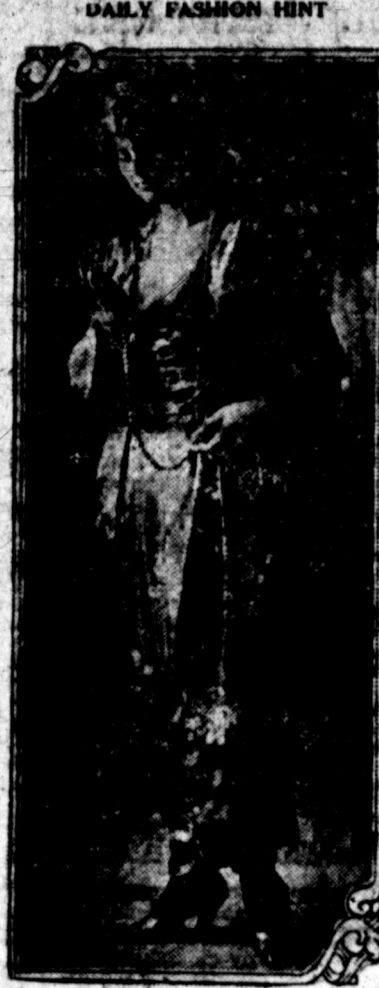
Afternoon gown of blue taffeta, with figures, and vestes of rose shades.

To cut short a cold over-night, to stop a sore throat, and to put the system in the best possible condition to avoid influenza and pneumonia, doctors are advising the new nausealess calomel, called Calotabs, which are free from the sickening and salivating effects of the old style calomel. At the first sign of a cold or sore throat, it is best to take a Calotab at once, before the inflammation has gone too far. You may thus save yourself a spell of sickness. One Calotab at bed time with a swallow of water—that's all. No salts, no nausea, no the slightest interference with eating, work or pleasure. Next morning your cold has vanished, your liver is active, your system is purified and refreshed and you are feeling fine with a hearty appetite for breakfast. Perhaps you can congratulate yourself that "stitch in time" has saved you serious illness. Calotabs are sold only in original sealed packages, price thirty-five cents. Your druggist recommends and guarantees Calotabs and will cheerfully give back your money if you are not delighted.