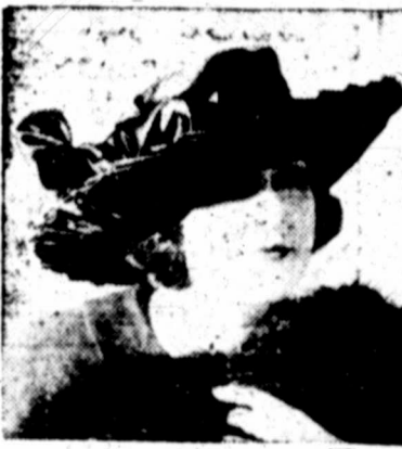
The slightly larger hat shown here is of tulle and has an up-turned pleated brim. One side of the draped crown is finished with a bow.