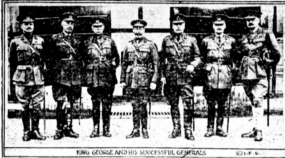
KING GEORGE AND HIS SUCCESSFUL GENERALS