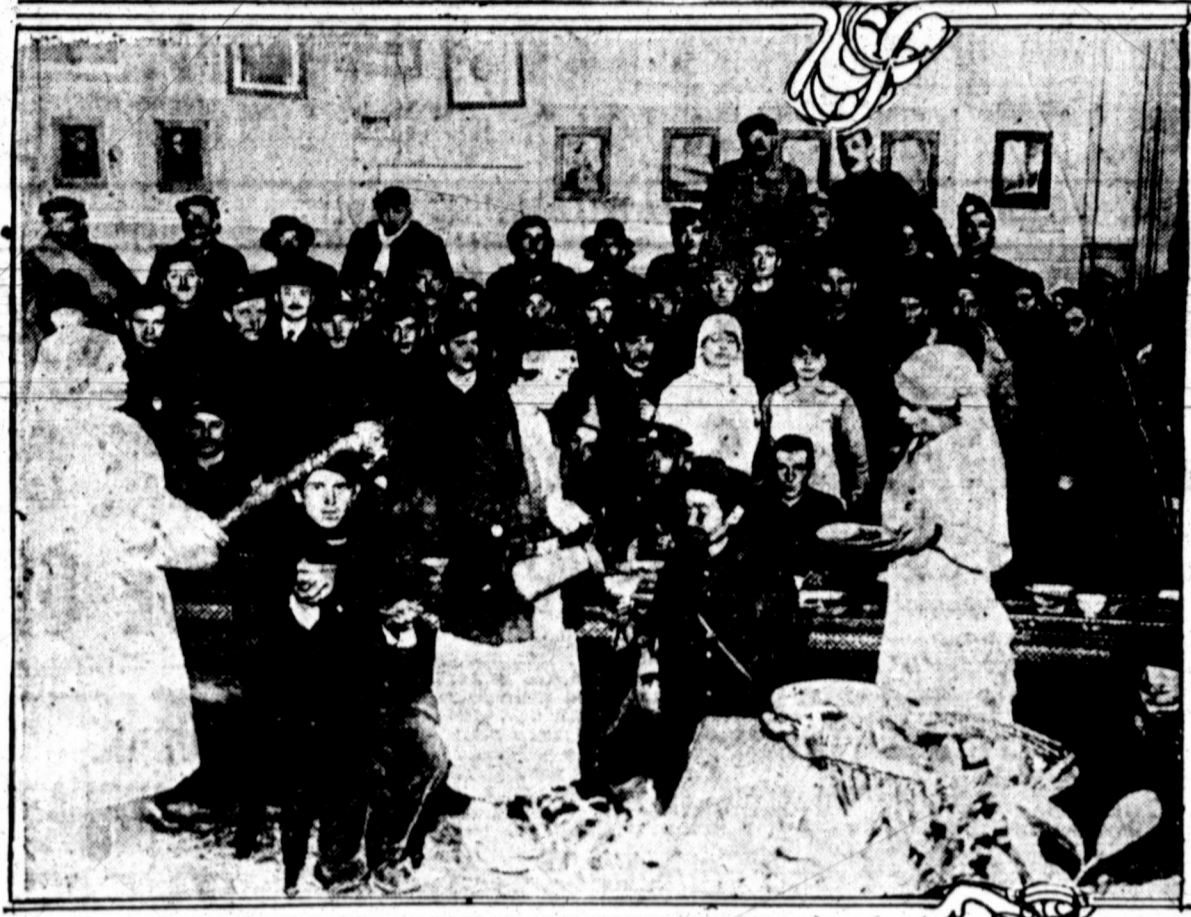
RELEASED FRENCH WAR PRISONERS

These men, who had suffered the horrors of captivity in Hun detention centres, were in pitiable condition when they reached the Gare du Nord. Some of them wore women's clothing.