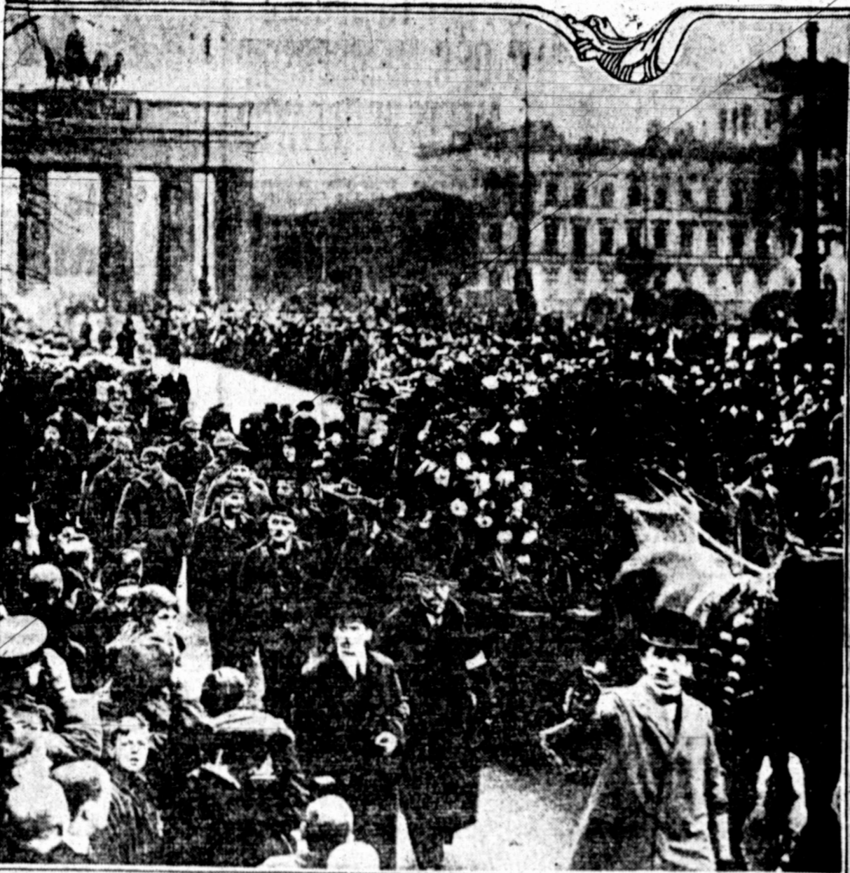
REVOLUTIONARY CROWD WITH BRANDENBURG GATE IN BACKGROUND

Government troops have decisively defeated the Spartacus group and have occupied all the public buildings in Berlin, according to latest advices. After several days of sanguinary street fighting, in which machine guns swept Unter den Linden, the Wilhelmstrasse and the most famous places and boulevards of Berlin, it is now reported that quiet has been restored.