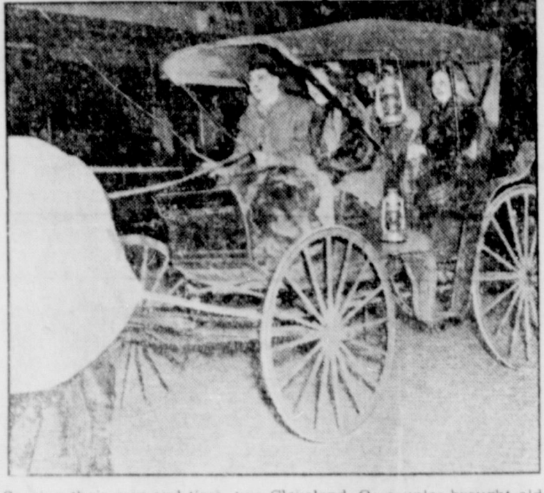
Sparing their cars and tires, two Cleveland, O., couples brought old dobbin and the gig out of oblivion and started out on their dates in this fashion. Accessories that helped in winter weather included blankets, het bricks, ear muffs, and the old gas lanterns.