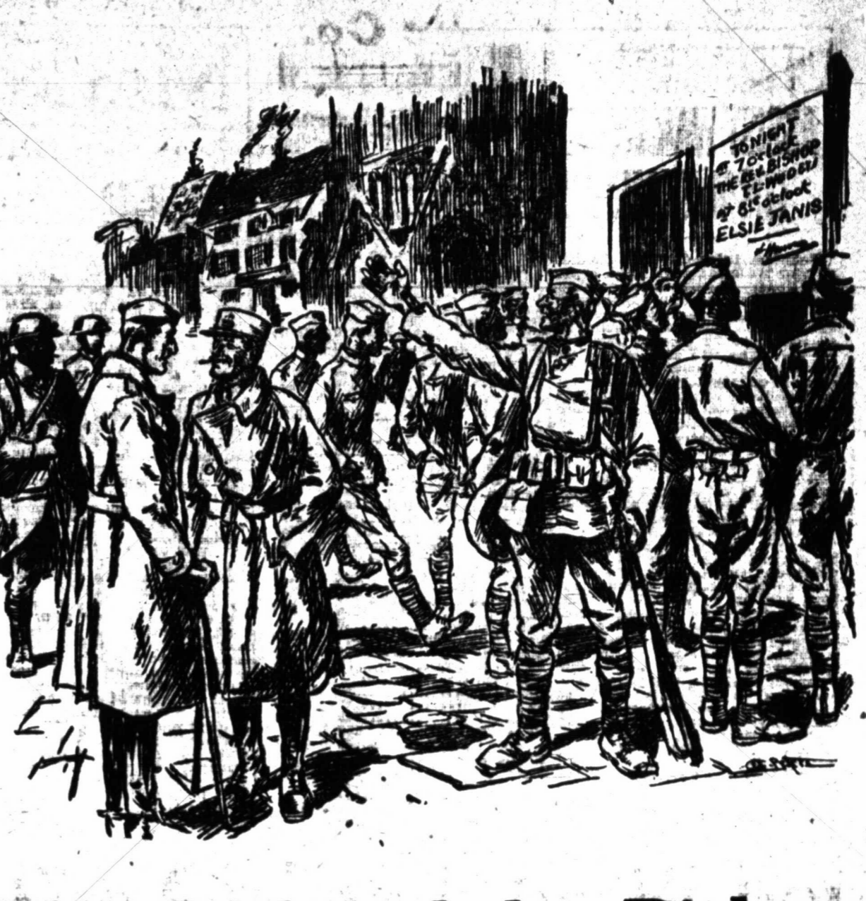
The Girl and the Bishop