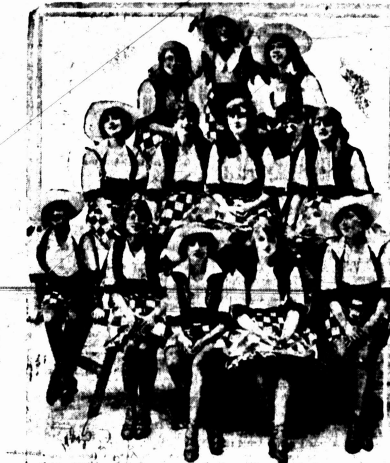
Scene from "Watch Your Step"—Wichita Theatre, Monday, October 14.

Billie Burke in "Watch Your Step". Scene from "Watch Your Step"—Wichita Theatre, Monday, October 14.