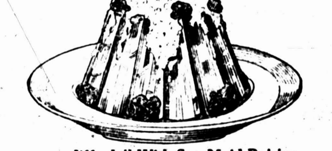
Jiffy-Jell With Sun-Maid Raisins

Another is Coffee flavor. That also must be sealed in glass to keep its aroma, as we do.