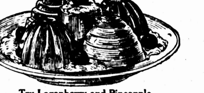
Try Loganberry and Pineapple

Dessert and Salad Molds—Assorted Styles—In Pure Aluminum