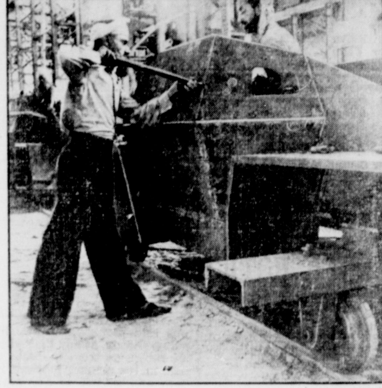
Mobilizing her might for war, India works overtime to mechanize her army. An assembly line in this railway shop turns out armored

nat most show patrons seem to training, gathered Friday night,