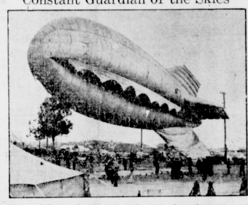
Barrage balloons placed at strategic spots along the west coast serve as guardians against enemy aircraft. This one goes aloft "somewhere in California."