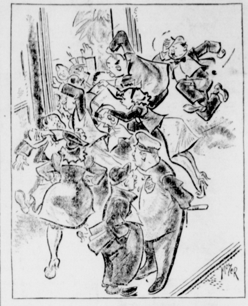
"Oh, that's the last restaurant in town that has open sugar bowls on the table."