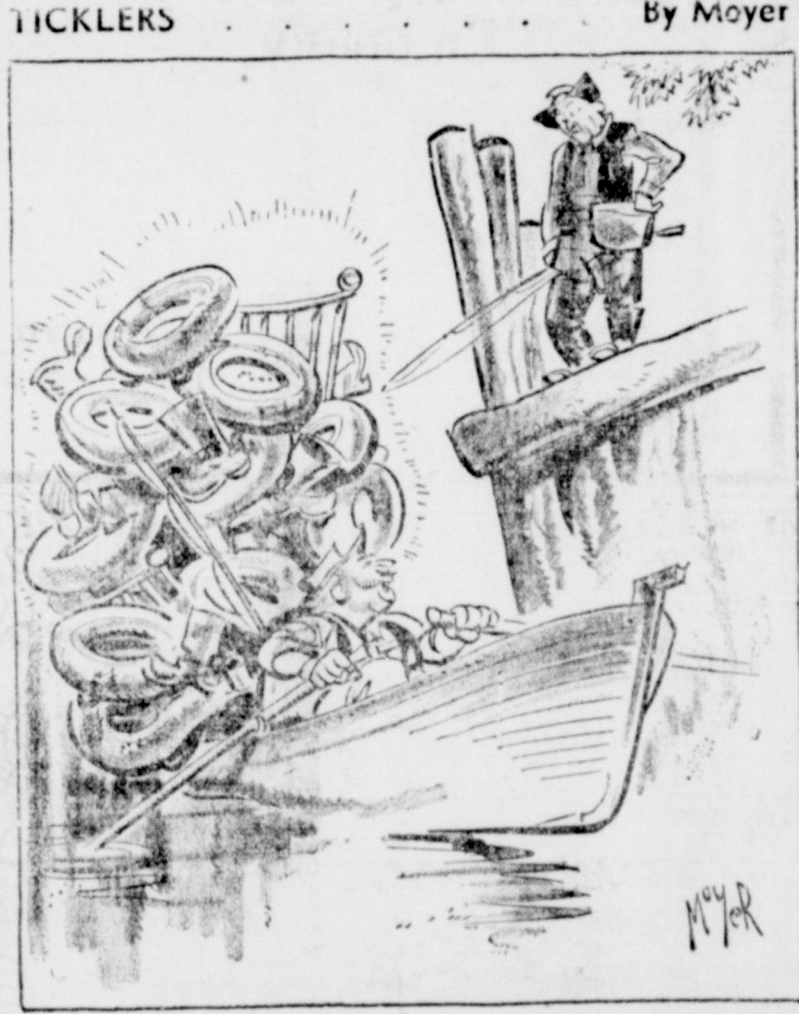
"Yes, sir! Best fishin' I've had in years."

That the administrator handle, * * * * * * * * * the subject, Mat. 28:19. If saved before baptism, a