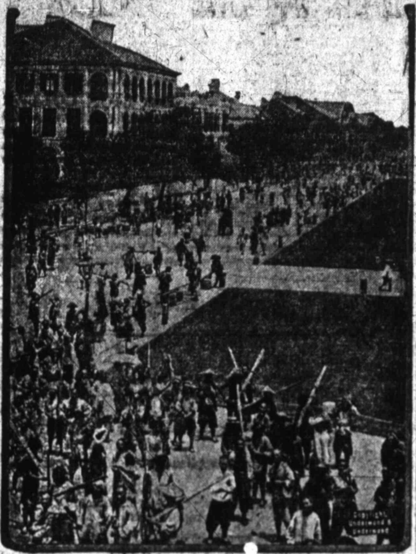
THE BUND, HANKOW