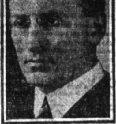
HENRY MORGENTHAU, JR. IN CHARGE OF TRACTOR EXPEDITION.

American tractors—1500 of them—sent by the U. S. Food Administration will battle hunger in France. When spring comes they will be in the field. They will help the French to grow 3,000,000 more bushels of food. The idea of reinforcing the waning agricultural strength of France with American tractors originated with Henry Morgenthau, Jr. The Food Administration has estimated Henry Morgenthau, Jr. to follow the machines to France and put them in operation. The first 100 tractors were sent to France on the deck of a naval transport and the entire number will reach there in plenty of time for spring plowing. The tractors will operate mainly in the battle-scarred portion of northern France which has been re-taken from the Germans. These property losses have been largely eliminated. The fields are consequently large and the batteries of tractors will be able to work more effectively. Thus in a few months food crops, especially wheat and potatoes, will be growing in French soil plowed by American tractors—battle lions.