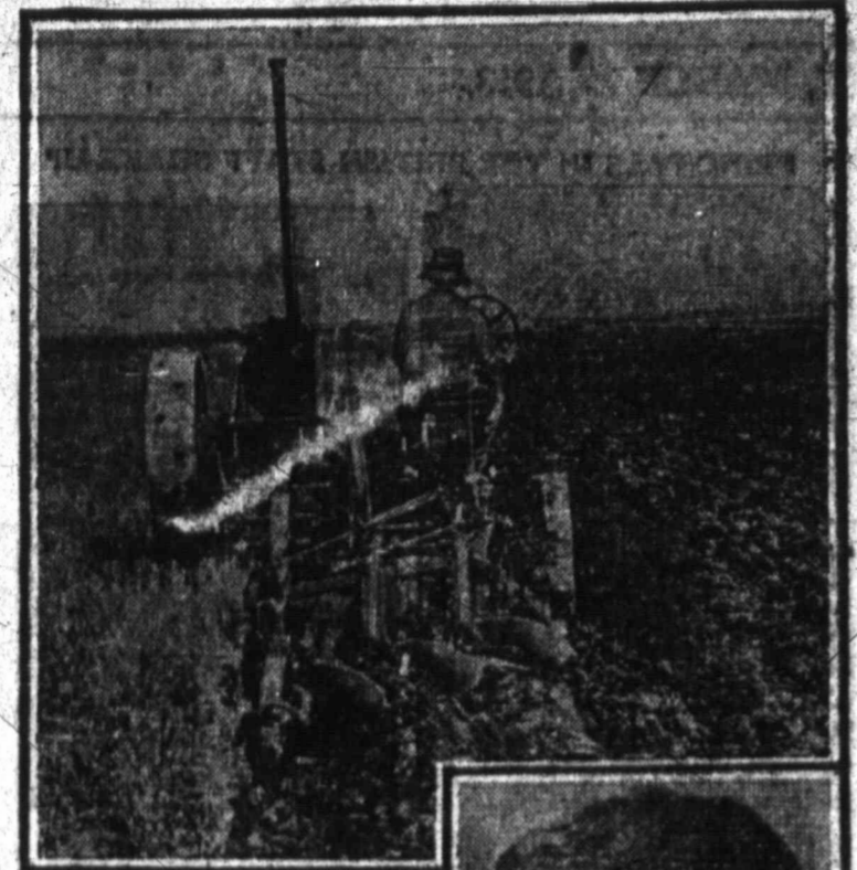
TYPE OF TRACTOR SENT AHEAD BY U. S. FOOD ADMINISTRATION.

American tractors—1500 of them—sent by the U. S. Food Administration will battle hunger in France. When spring comes they will be in the field. They will help the French to grow 3,000,000 more bushels of food. The idea of reinforcing the waning agricultural strength of France with American tractors originated with Henry Morgenthau, Jr. The Food Administration has estimated Henry Morgenthau, Jr. to follow the machines to France and put them in operation. The first 100 tractors were sent to France on the deck of a naval transport and the entire number will reach there in plenty of time for spring plowing. The tractors will operate mainly in the battle-scarred portion of northern France which has been re-taken from the Germans. These property losses have been largely eliminated. The fields are consequently large and the batteries of tractors will be able to work more effectively. Thus in a few months food crops, especially wheat and potatoes, will be growing in French soil plowed by American tractors—battle lions.