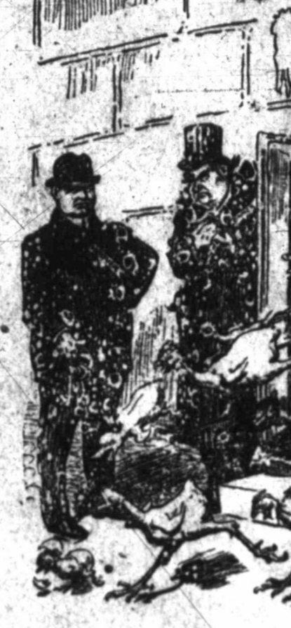
FEW PRISONERS TAKEN