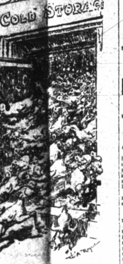
FEW PRISONERS TAKEN