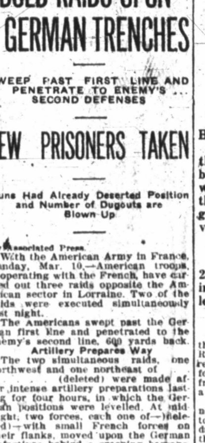
FEW PRISONERS TAKEN