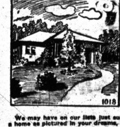
We may have on our lists just such a home as pictured in your dreams.

POSITION WANTED—College graduate, some experience in office work.