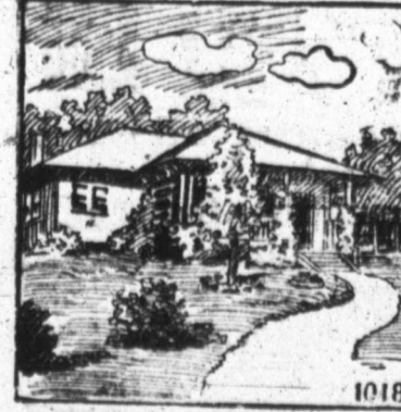
We may have on our lists just such a home as pictured in your dreams.

Office next door to Hearn Hotel. Phones 2036 and 1478