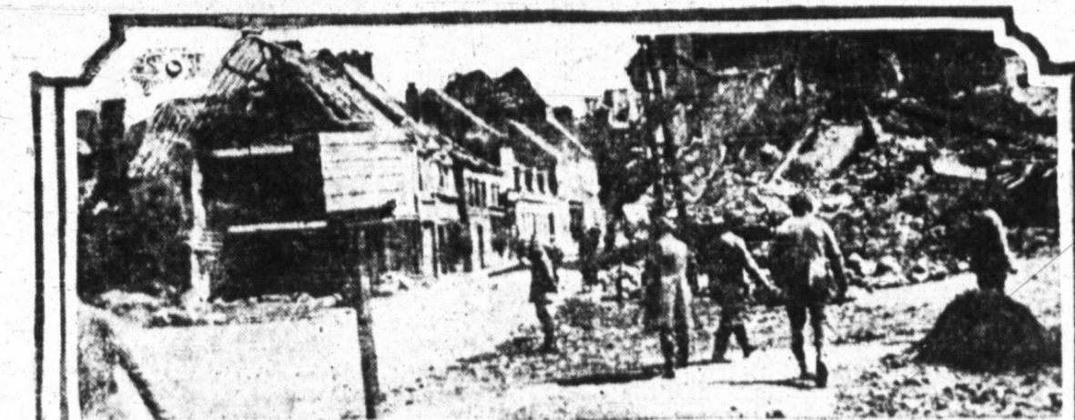
THE FOUR CORNERS AT HAM AFTER THE BOCHES EVACUATION. AMBULANCE DRIVER'S TENT CAMOUFLAGED AFTER ATTACK.