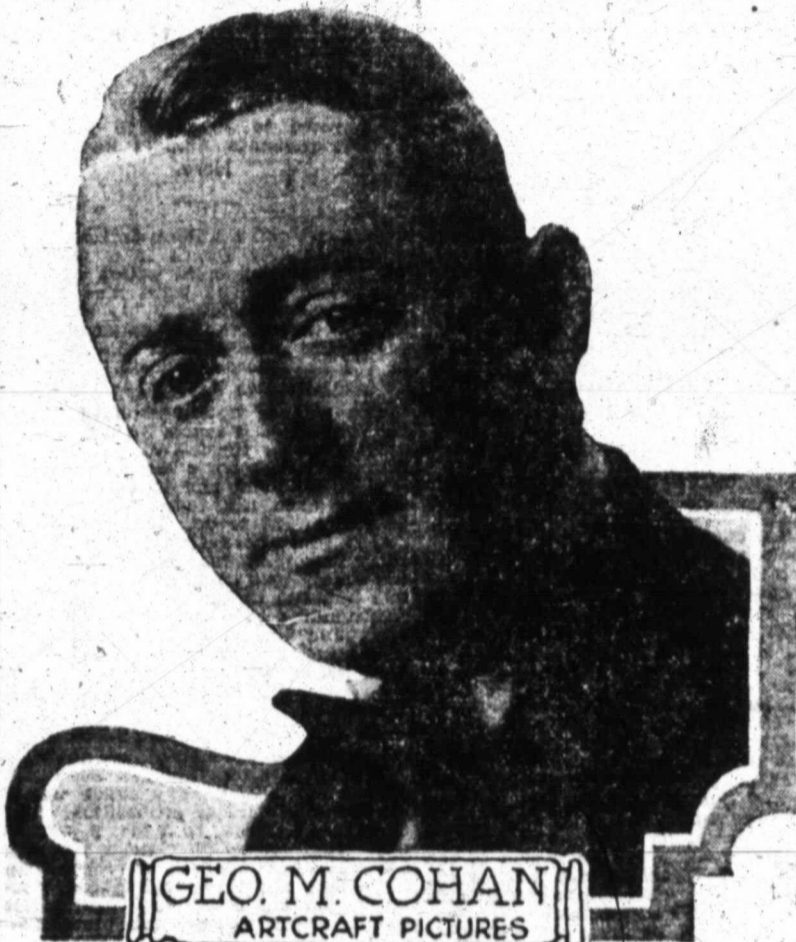
GEO. M. COHAN ARTCRAFT PICTURES

Broadway's Greatest Star Outshining His Brilliant Stage Career, In A Photo-Adaption of His Best and Funniest Play