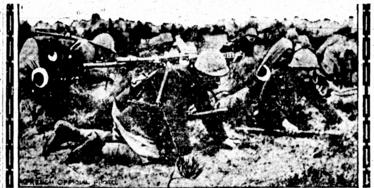
A remarkable picture taken in the Vosges mountains showing how the French machine gunners advance with their weapons, under fire, to take up new positions.