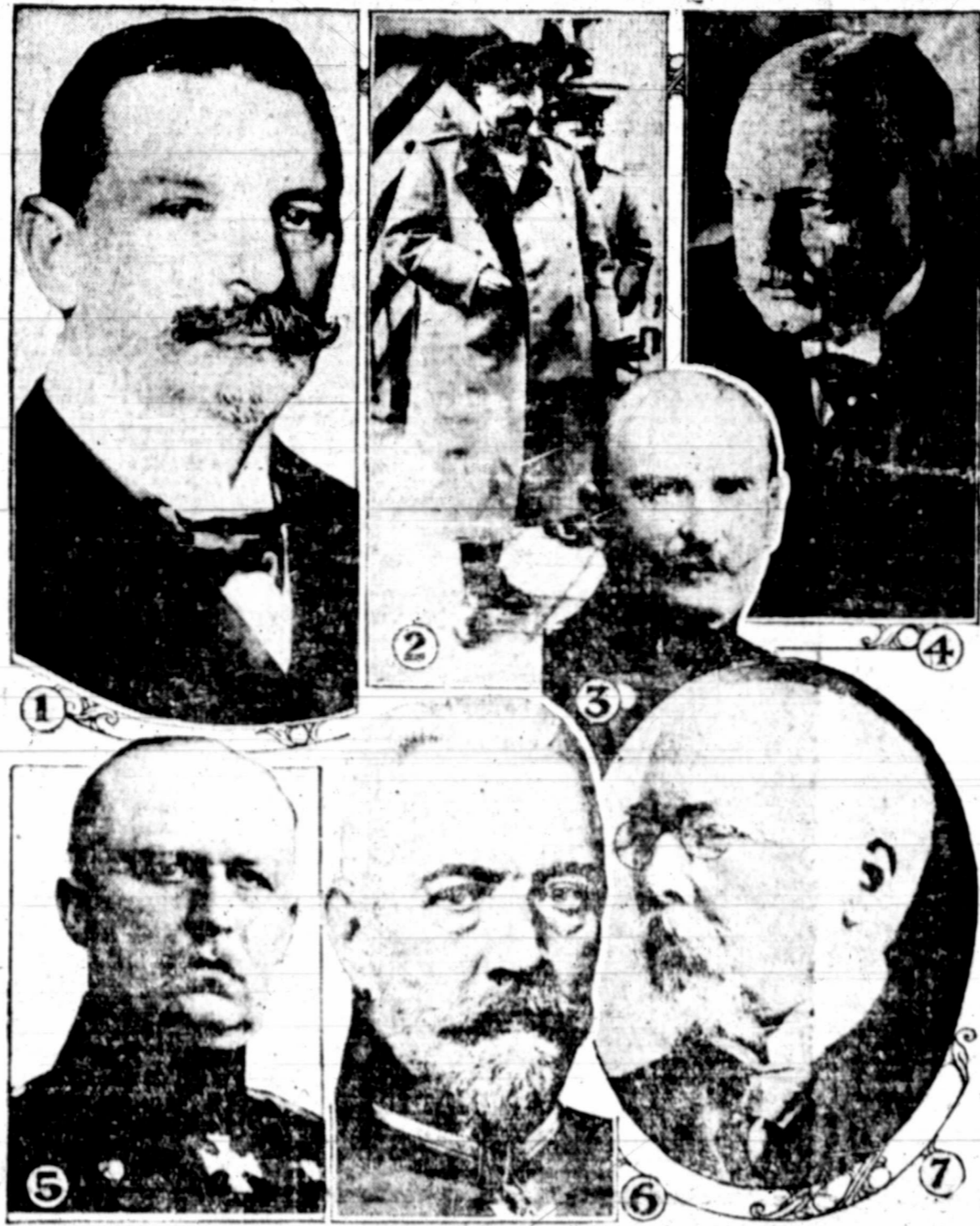
The men in the pictures are prominent German statesmen, soldiers, etc., whose names figure largely in the news that reaches us concerning the political crisis that has arisen in Germany over the questions of peace of honor, internal reforms, the success or failure of the submarine warfare, the food supply, etc.