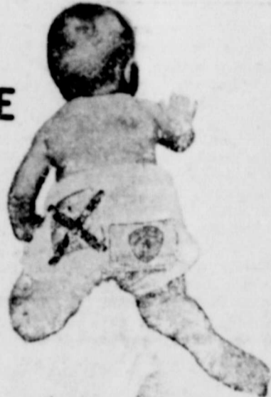
IT'S TIME FOR A CHANGE. The Department of Public Safety urges all motorists to get their 1964 inspection stickers before lines start forming at inspection stations.