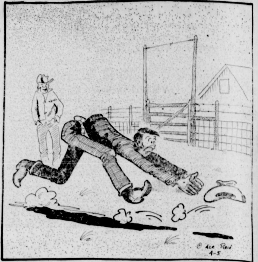
"Hey Jake, you'd never catch that hat if this wuzn't such a mild day!"