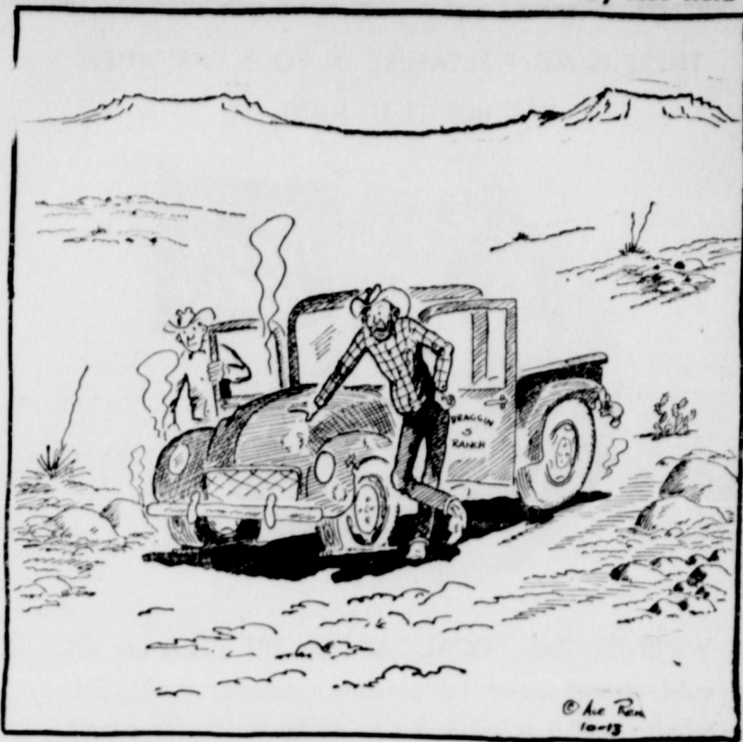
"Jist how am I gonna tell that banker there ain't no grass and ' need two tires all in one breath?"