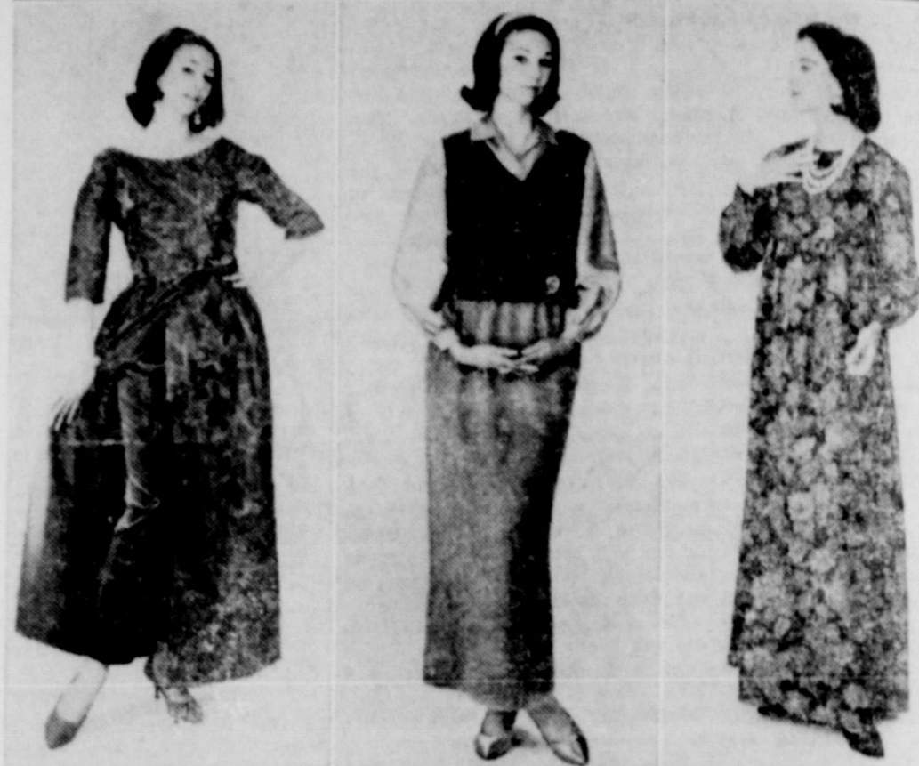
This fall you'll compliment your hostess by "dressing" for dinner. From left to right are pictured three fashion highlights of the seventh annual Sewing Fashion Festival with its exciting preview of 35 new fall fashions shown daily at the 1963 State Fair of Texas in Dallas, October 5 through 20. At the left is shown an over dress of Gottschalk Brocade lined with American Silk Mills Peau d'Or topping slim tapered pants of Cantoni Velveteen made from Vogue Pattern #1220. The soft shaping and the wide curving of the neckline are news. Pictured in the center is a design which brings into focus the new sportive look for evening wear, the skirt, blouse and pull-over ensemble. Made from McCall's Pattern #7069, the skirt of Kaplan's Mohair Loop in turquoise is topped by an aqua silk blouse with Glade Green overblouse of velveteen. On the right Butterick Pattern #3488 fashions a patio dress with Empire waist and flowing skirt made of Rosewood's Pussy Willow in a flower garden print.