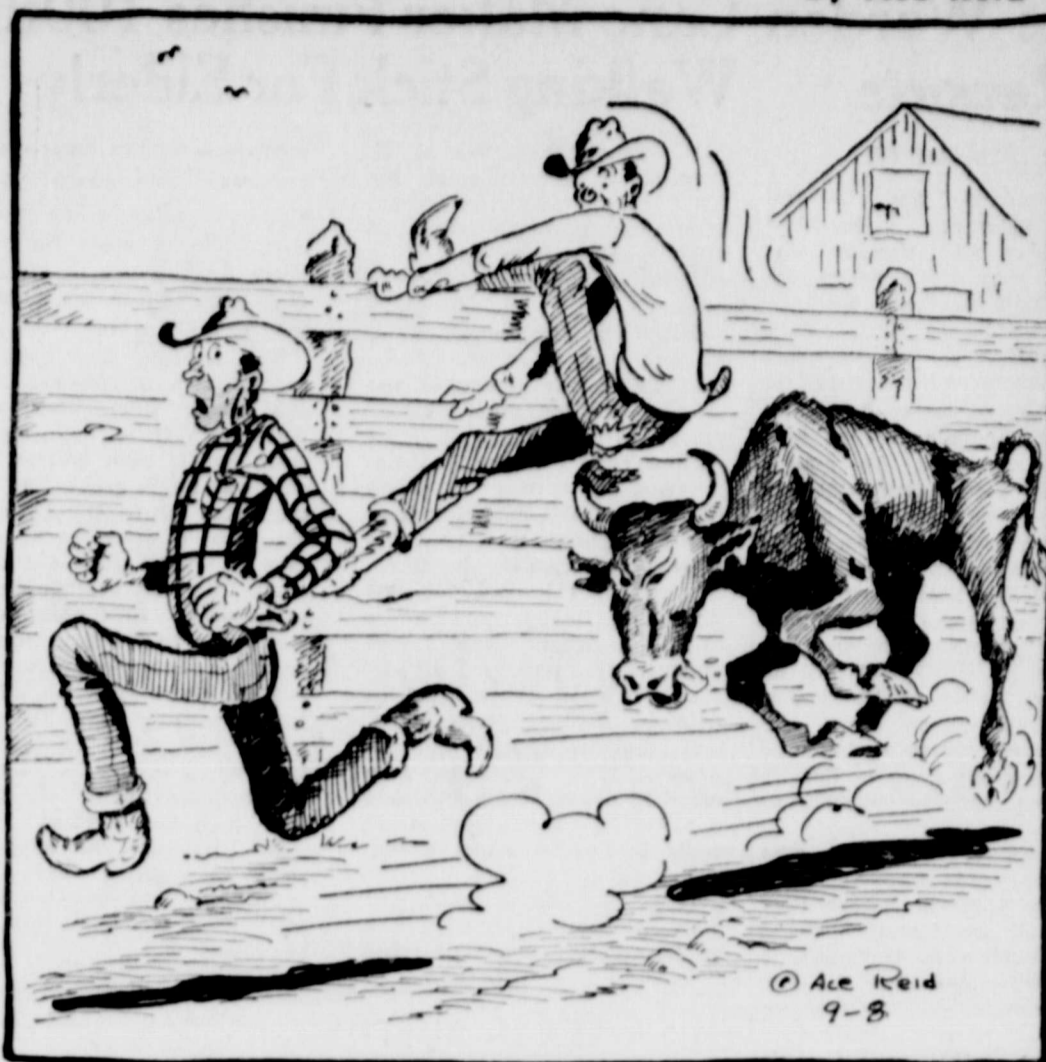
"Now, I didn't sell you no wild cow. She's jist playful!"