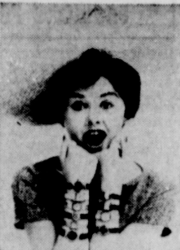
FAIR TIME. To assure being on time for the 1963 State Fair of Texas October 5 through 20 in Dallas, this pretty girl wears a collection of watches from the "Wonderful World of Fine Jewelry and Gifts" exhibit to be featured in the Women's Building. The jewelry pavilion will be sponsored by the Texas Jewelers Association with retailers, manufacturers and trade associations participating.

Tarleton State both summer semesters, and will again be a student in the fall.