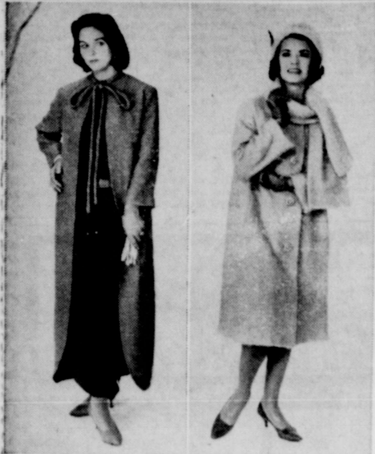
Among the 35 new fashions to be shown in Dallas at the seventh annual Sewing Fashion Festival at the 1963 State Fair of Texas, October 5 through 20, will be coat and dress ensembles for day and evening wear. On the left, Singer shows a pencil slim crepe sheath dress made from Vogue Pattern #1269 topped with a glittering coat of Matelasse. Both fabrics from American Silk Mills. The dress was applied on the Slant-O-Matic by Singer; at the right, a handsome coat with scarf is made of sand color Kaplan Mohair Loop from Simplicity Pattern #5148. This coat is worn over a Cantoni Suede Cloth jumper with blouse of American Silk Mills Silkalore from Simplicity Pattern #5140.