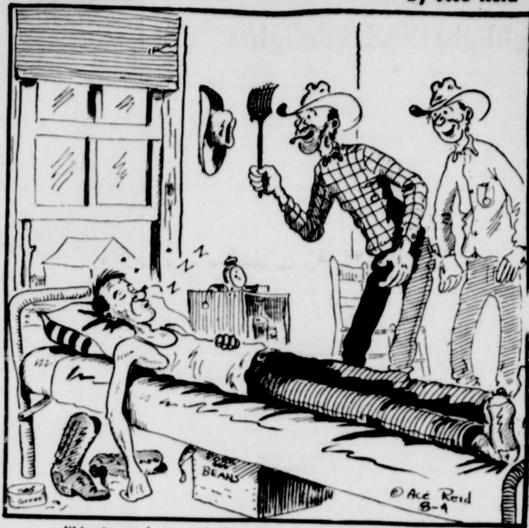
"No sir, we shore wanta keep that fly from disturbing our ole best buddy!"