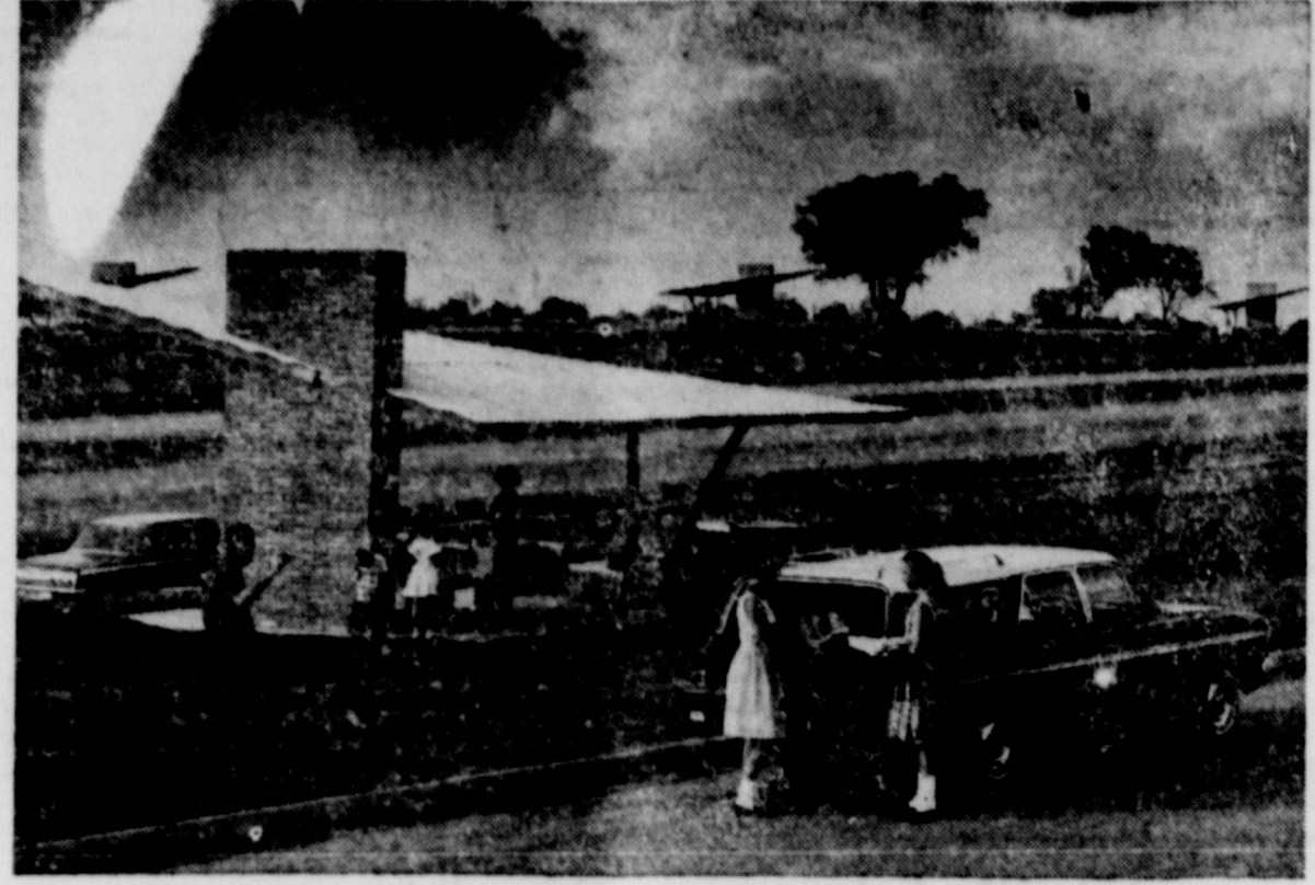
The Interstate Highway System in Texas is being blessed with large, elaborate Safety Rest Areas for the safety and convenience of Texas travelers. Motorists can now relax and refresh themselves in the first of these rest areas (roadside parks) designed and built on the Interstate Highway System in Texas. This new rest area contains eight arbors equipped with fire places for family cooking, incinerators, fire wood, and big spacious tables and benches for picnicking. The "park" lies on a small knoll ten miles east of San Antonio on Interstate Highway 10 and was formally dedicated May 29.

Industrial Picture Looks Good Texas fell from the second place ste House appropriations confer. to fourth among the Top Ten