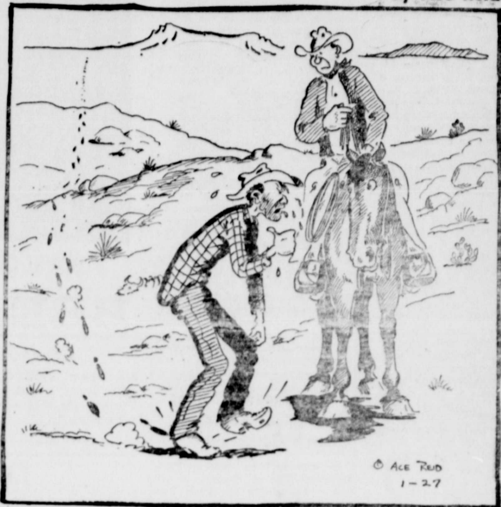
"Nope, I didn't get bucked off no hoss, my jeep's outa gas."

the dead wood, back to good live wood. Should you like, paint the cut surface with shellac and repeat the painting two or three times during the year.