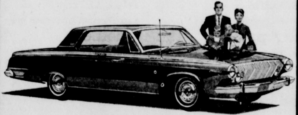
... OR FIVE FULL YEARS

Whether you measure it in miles, months or mopets, the warranty on the '63 Dodge is the longest in the industry. It holds good for a full five years or 50,000 miles, whichever comes first.