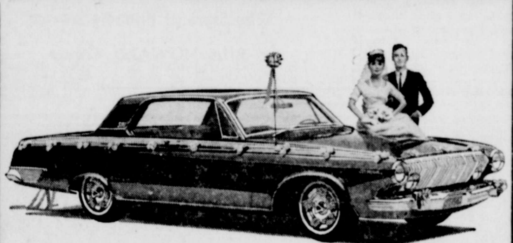
THE 1963 DODGE IS WARRANTED FOR 50,000 MILES