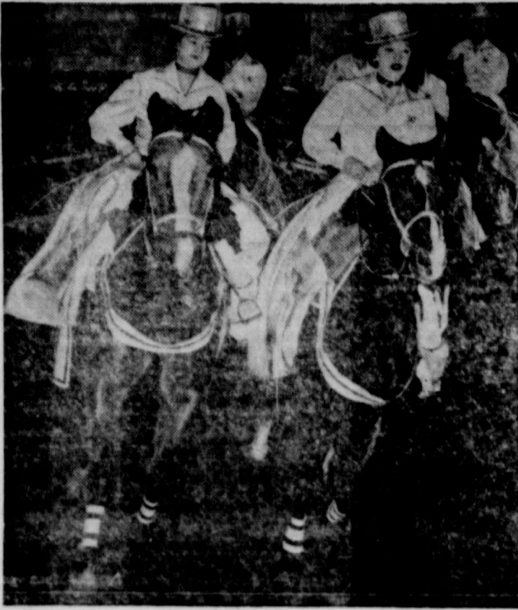
SIDE-SADDLE SUSANS —Riding through a fast precision routine that includes an exciting Maypole and black light presentation, 18 Side-Saddle Susans along with six handsome male escorts will entertain patrons of the Fort Worth Stock Show Rodeo Spectacular, January 25 through February 3. Minnie Pearl, America's foremost country-style comedienne, also will appear in each performance of the Fort Worth Stock Show Rodeo—which will have rodeo's toughest bucking broncs and bulls selected from the strings of three major rodeo producers. Other features include The Flying Cimarrons, five dare-devil trick riders, and Ken Boen with his comical "New Groove Mares."