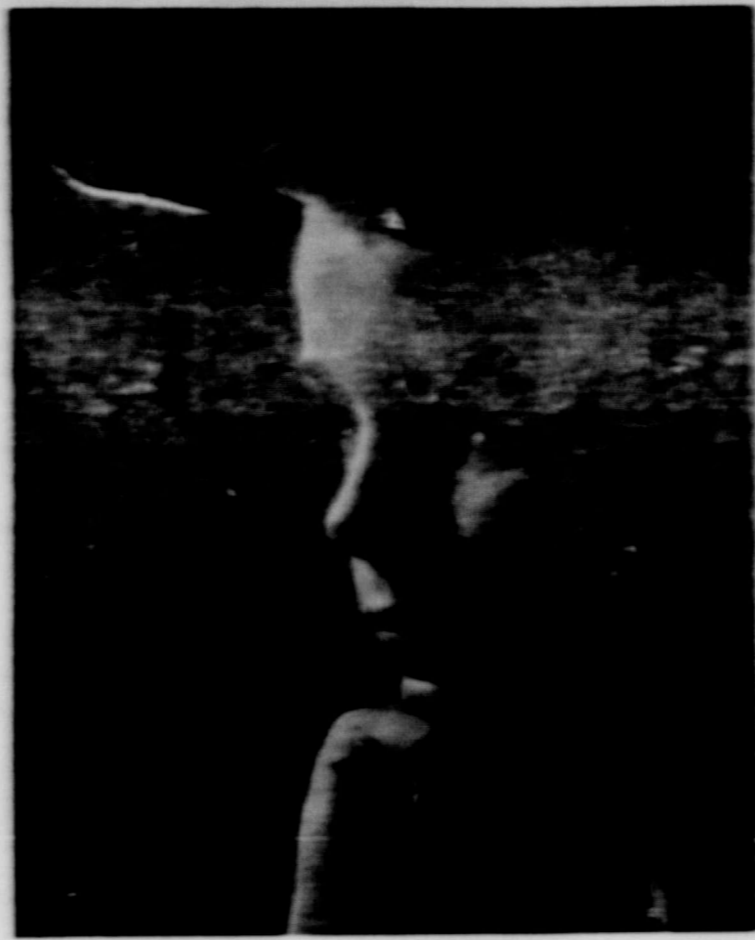
BOYS! GIRLS! DON'T MISS

"Why, then, is it that the goal is in the distance so far that hopes seem to vapor, but thank God for a ray of hope," the speaker commented.