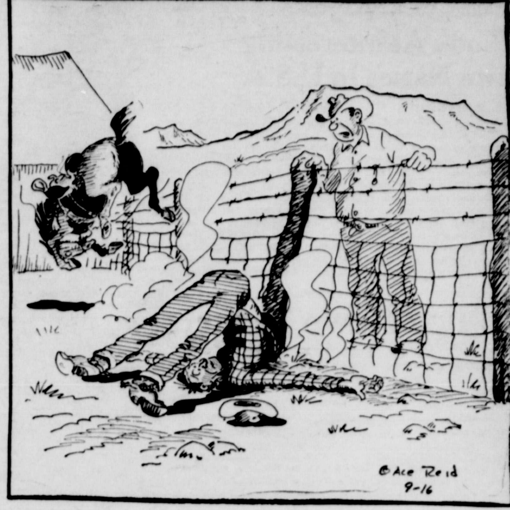
"All right clumsy, now you're gonna have to re-set this post and re-stretch the wire!"